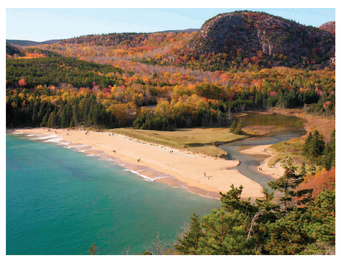
ACADIA NATIONAL PARK, MAINE, U.S.A.

This popular sandy beach is seen in the fall season with the foliage in color. Yellow leaves come from birch trees ( Betula sp.), red leaves from maples ( Acer sp.) and the green are spruce ( Picea sp.) and fir ( Abies sp.) trees. This is a youthful forest that burned in 1947. The beach is composed of cold-water carbonate sands comprised of barnacles ( Balanus sp.), blue mussels ( Mytilus edulis ) and echinoderm ( Strongylocentrotus droebachiensis ) spines. The mountain in the background is composed of Silurian granite. (Photograph taken October 2008, and caption by Joseph T. Kelley, Department of Earth Sciences, University of Maine, U.S.A.)