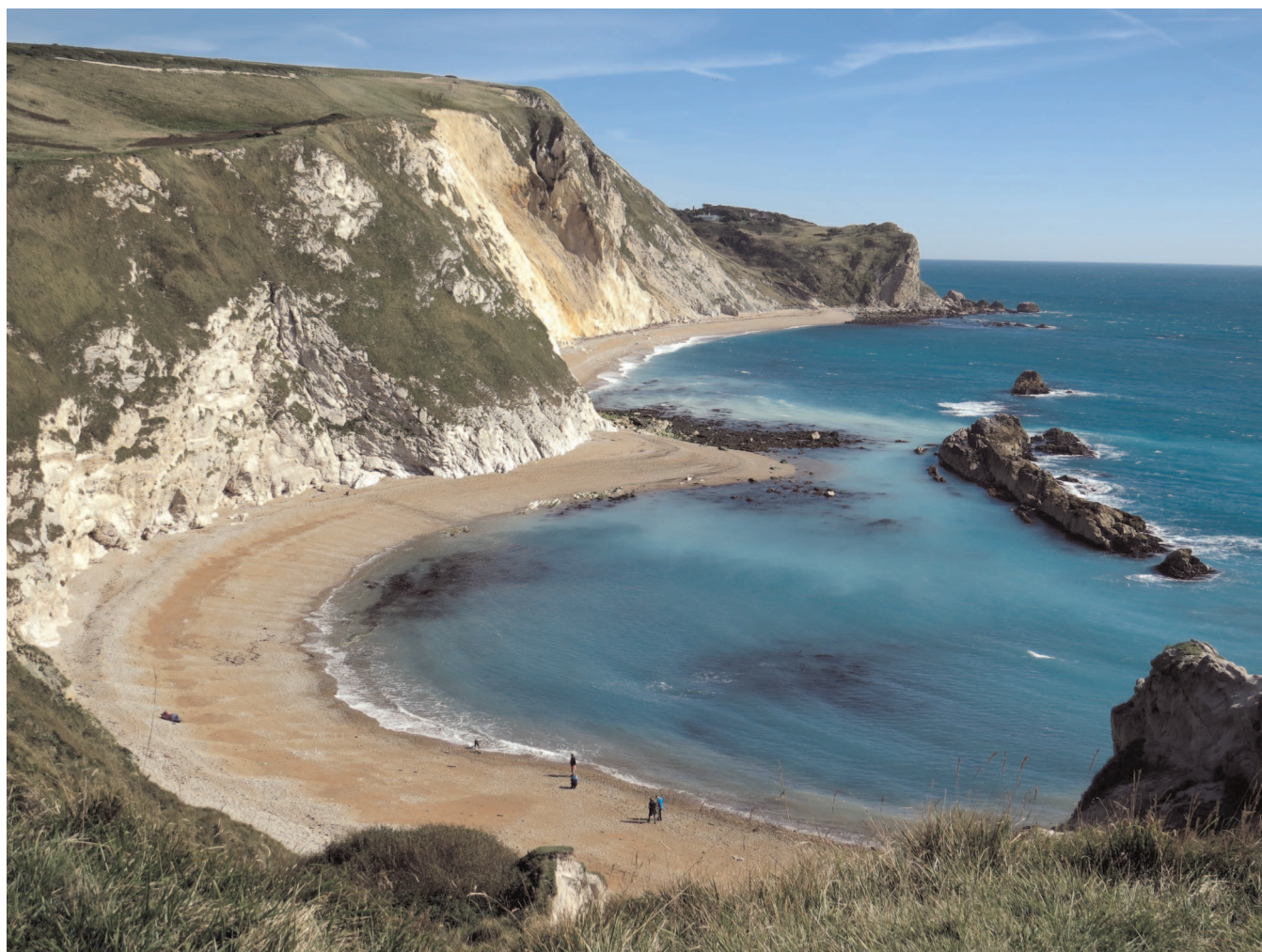
Man O'War Bay along the Jurassic Coast of Dorset, southern England. The Jurassic Coast is a designated World Heritage Site along the English Channel coast of southern England. Stretching a distance of nearly 155 km, this segment of coastline provides over 180 million years of coastal geologic history through the presence of Triassic, Jurassic, and Cretaceous cliffs. The coast is also unique in that stretches of both concordant and discordant shorelines can be found, along with a plethora of coastal landforms. For example, in Man O'War Bay, as shown above, the limestone has been tilted up so forcefully by regional folding and faulting that a nearly vertical orientation now exists at this location. Of particular interest is that this resistant bed of limestone results in forming an offshore barrier, partially protecting the Bay from wave attack and erosion.