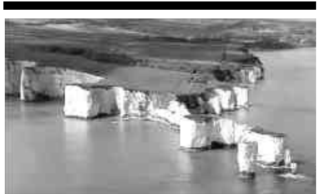
Figure 2A). Chalk stacks and cliffs at Old Harry Rocks, Isle of Purbeck.