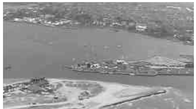
Figure 2B). Spits at the entrance to Christchurch Harbour