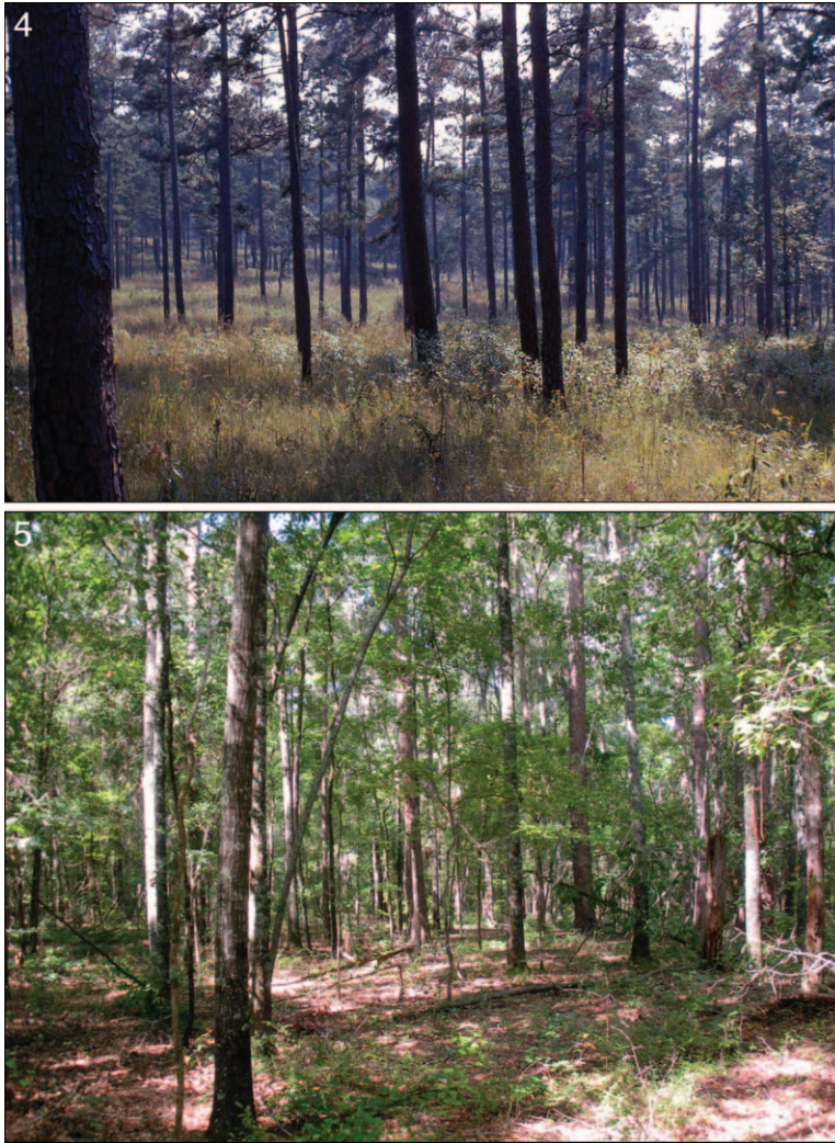
Figure 4. Open pine woodland of NB66 in 1967, looking southwest through plot A4. Dense, grass-dominated ground cover is evident with brushy hardwood coppice protruding above the grasses.