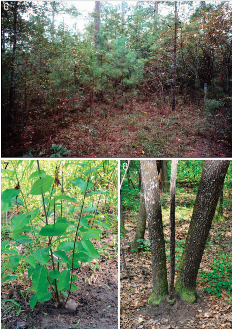
Figure 6. Photo taken in 1977 at nearly the same place as photos in Figures 4 and 5, which shows a thicket of young hardwoods growing from coppice and young pines growing from seeds, with a grassy opening in the foreground. See p. 438 in Engstrom et al. (1984) for a photo with the same view in 1981.