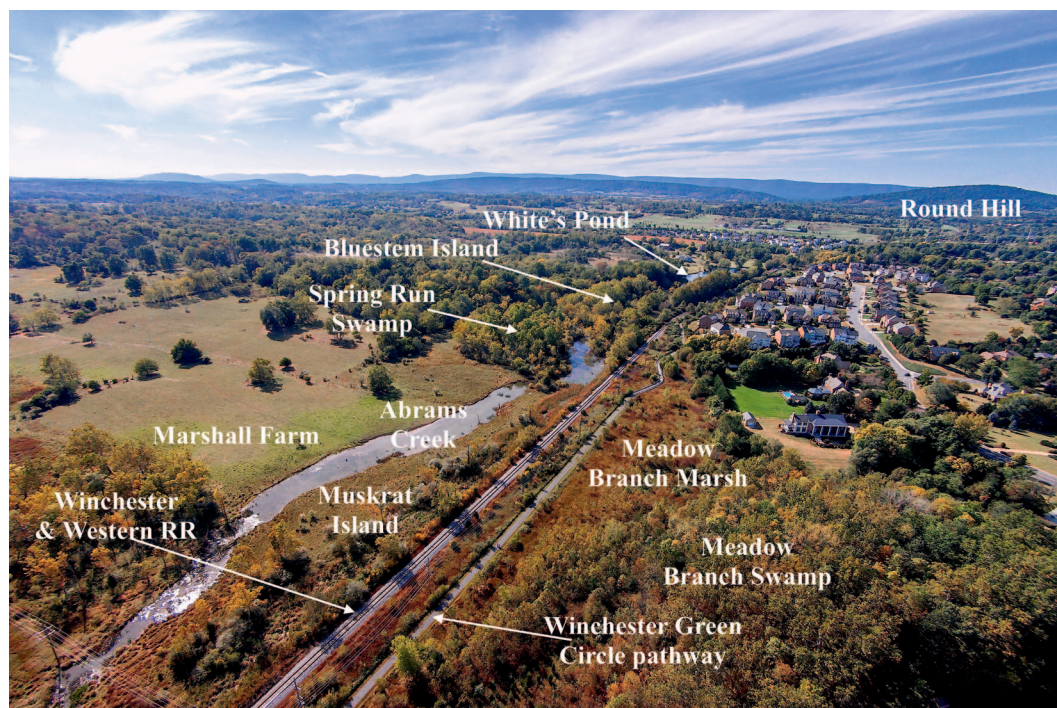
Figure 1. Abrams Creek Wetlands, adjacent land uses, and physiographic setting looking west across the Shenandoah Valley to the Allegheny Mountains. Boundary between Frederick County (left) and Winchester City (right) follows the railroad tracks. Headwaters of Abrams Creek are on Round Hill.

(Davis 2003; Mangino 2003a, 2003b; Gomes 2014).