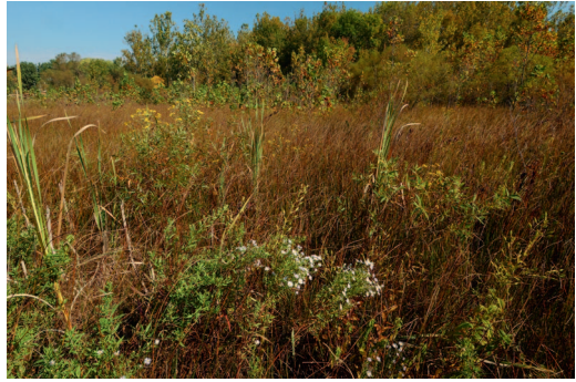
Figure 4. Calcareous wet prairie (CW) habitat type at Meadow Branch Marsh. Dominated by Scirpus pungens ; Symphyotrichum praealtum var. angustior flowering in foreground. Note invasion by Platanus occidentalis , Cornus amomum , and other native woody species in background.

Abrams Creek, and the deepest outflow of Pennypacker Spring. Diagnostic indicator species include Bidens laevis , Lemna minor , Nuphar advena , Potamogeton foliosus , Potamogeton illinoensis , and Sparganium americanum . State-rare species restricted to this habitat include Lemna trisulca (G5S1) and Sparganium emersum (G5S1). Chara sp. dominates much of the substrate of Pennypacker Spring and White's Pond. The introduced species Myriophyllum aquaticum is an aggressive invader at Pennypacker Spring. The vegetation of these habitats represents the Floodplain Pool/Pond and Semi-permanent Impoundment ecological groups of the Virginia state vegetation classification (Fleming and Patterson 2017). Much of the vegetation of the natural (nonimpounded) sloughs and channels equates to the Nuphar advena – Nymphaea odorata Aquatic Vegetation association (CEGL002386; G4G5SU) of the USNVC (Faber-Langendoen 2001).