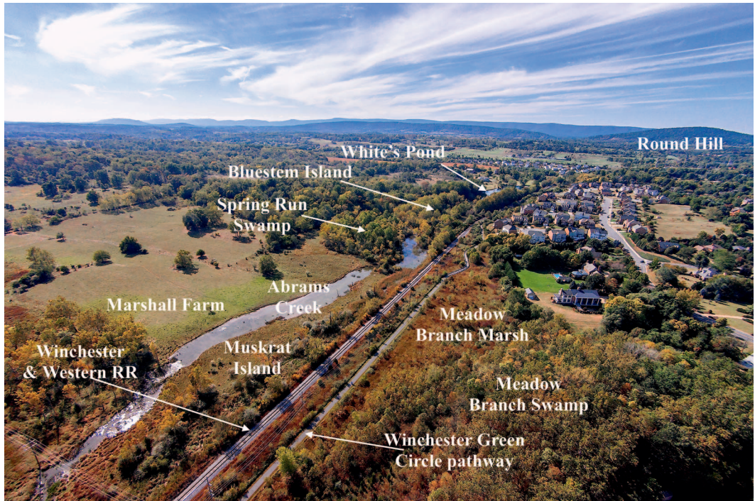
Figure 1. Abrams Creek Wetlands, adjacent land uses, and physiographic setting looking west across the Shenandoah Valley to the Allegheny Mountains. Boundary between Frederick County (left) and Winchester City (right) follows the railroad tracks. Headwaters of Abrams Creek are on Round Hill.

(Davis 2003; Mangino 2003a, 2003b; Gomes 2014).