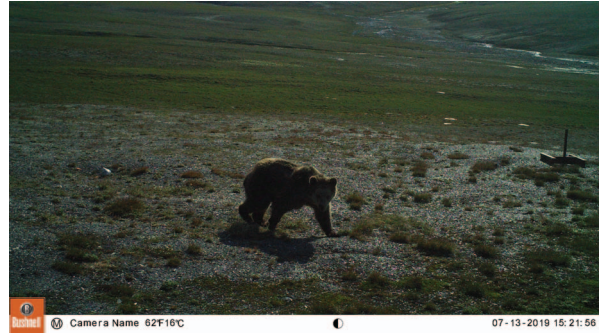
Fig. 3. An apparent brown bear ( Ursus arctos ) photographed by a remote camera trap on Cape Waring, Wrangel Island, Russia, on 13 July 2019.

We routinely perform ground-based observational surveys for multiple wildlife species on Wrangel Island during the summer and autumn. On 28 August 2019 during a survey on Bruch Spit, located on the east coast of the island (approx. N71.34° W177.79°), we sighted a running bear that had been resting in a daybed prior to being disturbed by the sound of our vehicles (Fig. 2). The bear had features characteristic of brown bears including a dark coat, distinctive hump, and shortened face (Geptner et al. 1967). The bear appeared healthy and in good body condition. We gathered approximately 10 hairs for genetic