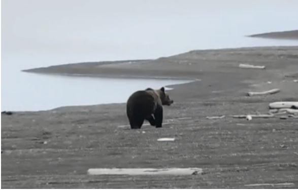
Fig. 2. A confirmed brown bear ( Ursus arctos ) on Bruch Spit, Wrangel Island, Russia, on 28 August 2019.

Most adult females in the Chukotka–Alaska polar bear population (also referred to as the “Chukchi Sea subpopulation,” with different boundaries; Durner et al. [2018]) build their maternal dens on Wrangel Island (Belikov 1977, Rode et al. 2018). Each year, a substantial proportion of the approximately 3,000 bears in the population (Regehr et al. 2018) spend the summer and autumn on Wrangel, waiting for the sea ice to reform (Kochnev 2002, Ovsyanikov and Menyushina 2010, Rode et al. 2015). Climate change has led to declines in the extent and thickness of Arctic sea ice (MacDonald 2010, AMAP 2017), which has negatively affected some of the world’s 19 polar bear subpopulations (Durner et al. 2018) and is expected to affect nearly all polar bears in the longer term (Atwood et al. 2016, Regehr et al. 2016). As polar bears are forced to spend longer periods on land (Stirling and Derocher 2012, Wilson et al. 2017), opportunities for contact with brown bears will likely increase where the ranges of the species overlap.