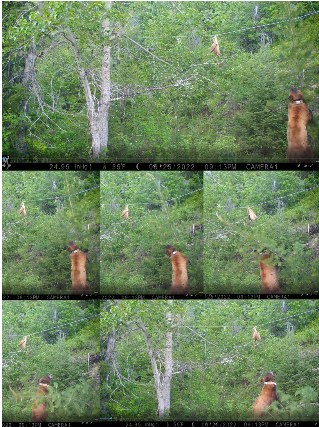
Fig. 2. Photo series of Bear M48 ( Ursus americanus ) manipulating a tree sapling in an apparent attempt to reach hanging food near a cage trap on 25 June 2022 on MPG Ranch in western Montana, USA.