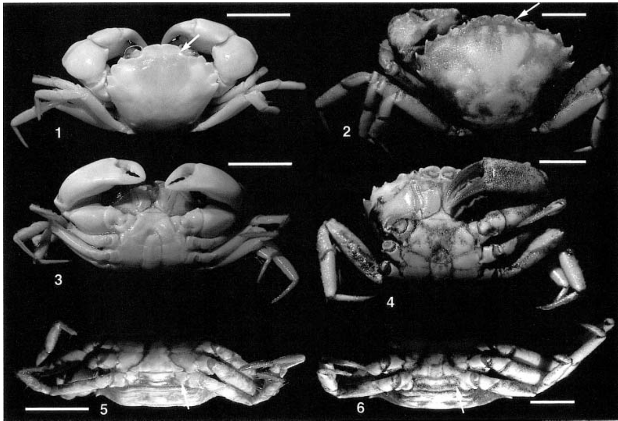
Figure 2. Comparison of Eucratopsinae (E) with Pseudorhombilidae (P), highlighting important differences. 1. Eucratopsis crassimanus (Dana), USNM 45950, arrow indicates lack of intraorbital spine on orbital margin (E). 2. Euphrosynoplax campechiensis Vazquez-Bader and Garcia, USNM 267608, arrow indicates intraorbital spine on orbital margin (P). 3. Eucratopsis crassimanus (Dana), male, USNM 45950, ventral surface (E). 4. Euphrosynoplax campechiensis Vazquez-Bader and Garcia, male, USNM 267608, ventral surface (P). 5. Cyrtoplax spinidentata (Benedict), USNM 82158, male, arrow indicates large portion of somite 8 visible and abdomen not touching coxae of fifth pereiopods (E). 6. Euphrosynoplax campechiensis Vazquez-Bader and Garcia, male, USNM 267608, arrow indicates that very little of somite 8 is visible and that somite 3 of the abdomen does touch the coxae of the fifth pereiopods. Scale bars equal to 1 cm.

topsinae is consistently higher than in the Pseudorhombilidae, although each set of ratios shows a small amount of overlap. At present, use of these ratios appears to be the best means of distinguishing the two taxa in the fossil record, because the major differences between extant forms are in the morphology of the pleopods (Hendrickx, 1998).