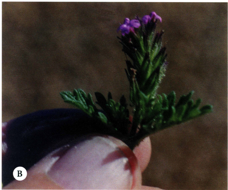
FIG. 12. Glandularia pumila (Brewster Co., Turner 96-215 [TEX]) a. showing prostrate growth; b. Close-up of raceme.