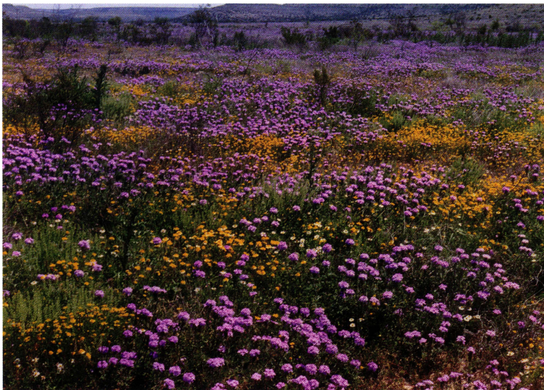
FIG. 8. Population of Glandularia bipinnatifida var. bipinnatifida ca 45 km northeast of Sanderson (Terrell Co., Turner 97-89).