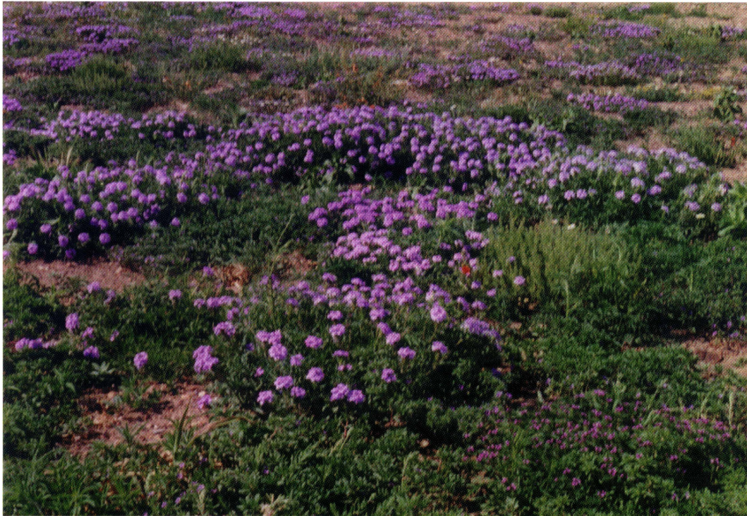
FIG. 10. Population of Glandularia bipinnatifida var. ciliata (Brewster Co., Turner 97-75.)