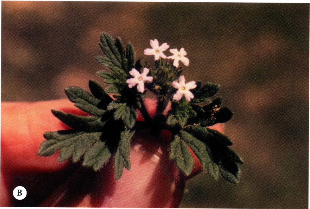
FIG. 13. Glandularia quadrangulata (Crockett Co. Turner 97-01 [TEX]). a. prostrate growth habit; b. Close-up of raceme.