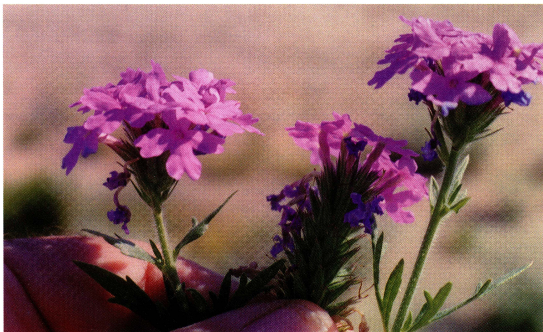
FIG. 9. Glandularia bipinnatifida var. bipinnatifida (cf. Fig. 8).