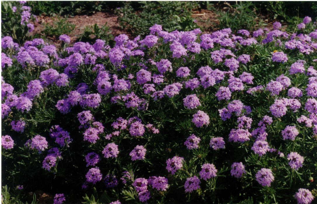
FIG. 11. Glandularia bipinnatifida var. ciliata (cf. Fig. 10).