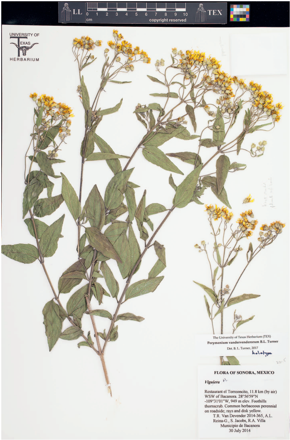
FIG. 1. The type specimen of Perymenium vandevenderorum B.L. Turner located at TEX.