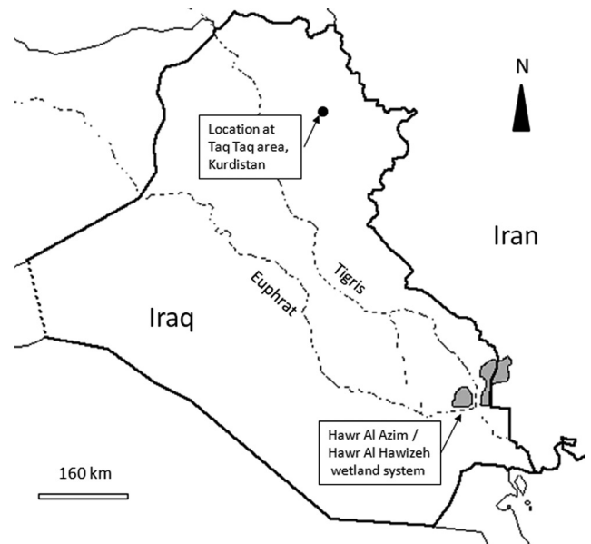
Fig. 1. Location of the Hawr Al Azim/Hawr Al Hawizeh wetland system on both sides of the Iraqi-Iranian border and the location of the River Nal Zab al Saghir, Taq Taq area in Kurdistan.

Skins from two otters were collected in the wild in November 2008. The first otter was found dead at Taq Taq area (on the River Nal Zab al Saghir) in Kurdistan, northern Iraq (N 35° 53', E 44° 37'; Fig. 1). The second was purchased from a hunter who killed the animal on the Iraqi side of the Hawizeh Marshes (N 31° 37', E 47° 43'; Fig. 1). Based on morphological and phenotypic characters (i.e., dark, smooth and