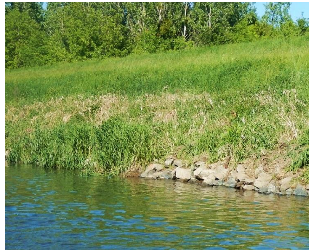
Fig. 1. Illustration of a vegetated stretch (left) and cleared stretch (right) of rip-rap bank stabilisation along the River Dyje (Czech Republic), used for testing preference or avoidance of rip-rap by three fish groups, i.e. round goby, tubenose goby and non-gobiid species.

Since 2014, a series of exceptionally dry years and a shift in peak rainfall has affected the river's hydrological regime, resulting in lowered water levels, reduced flow rates and a lack of flood events. A subsequent increase in siltation along the banks covered the rip-rap, which quickly became overgrown with filamentous algae and aquatic and riparian vegetation, especially reed canary