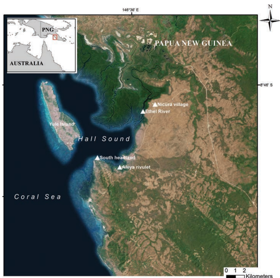
Figure 2. Dr James' collection locations around Yule Island, New Guinea.

The birds that Sharpe described were collected on Yule Island and the New Guinea mainland around Hall Sound (Sharpe 1878) (Fig. 2). This general area was already known