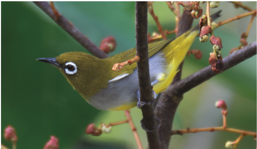
Figure 2. Zosterops 'tahanensis' , Keledang Sayong Forest Reserve, inland Perak state, Peninsular Malaysia; differs from nominate auriventer (which is unknown in life) only by average measurements (see Wells 2017, this issue)