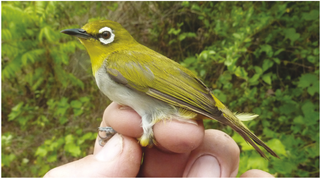
Figure 1. Zosterops (palpebrosus) 'auriventer' (= erwini ), mangrove zone, Khlong Thom district, Krabi Province, peninsular Thailand, i.e., at the proven end-point of erwini range closest to the type locality of nominate auriventer