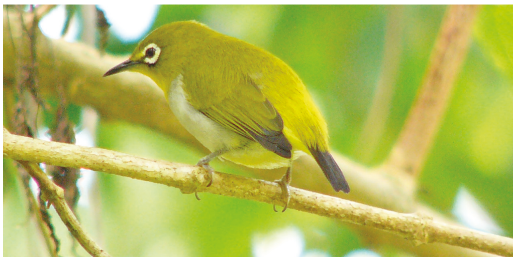
Figure 3. Unidentified coastal white-eye, Damai, Santubong Peninsula, south-west Sarawak, western Borneo