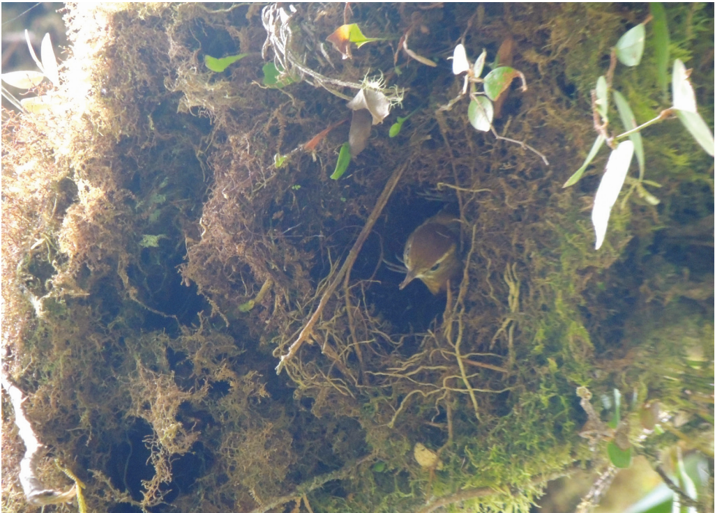
Figure 2. Nest of Ruddy Treerunner Margarornis rubiginosus , collected on June 2015, at Cerro Chompipe, Heredia province, Costa Rica (nest 3) (Ariel A. Fonseca-Arce)

materials of the inner chamber and tunnel, study the wall surroundings and measure the inner chamber dimensions (measurements 7–8, Fig. 3).