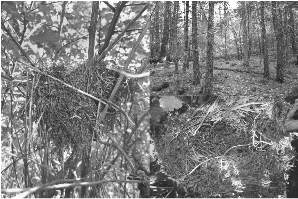
Figure 2. The environs and possible nest of Russet Nightingale-Thrush Catharus occidentalis , Sierra del Carmen, Coahuila, Mexico, June 2007. Clockwise from left: an old nest from the side, with dense moss still largely intact, but most pale twigs / grass have fallen off (some still visible hanging from the nest); the steep slopes of the ravine in which the nest was sited; the same nest from above, showing the thickness of the moss cup and the carefully constructed lining of rootlets and conifer needles (Eliot T. Miller)

pale grey. The bird sang almost continuously until we left at 10.15 h. We returned on 7 June 2007 and were able to record two brief song bouts using a digital camera ( http://www.xeno-canto.org/357625 , http://www.xeno-canto.org/357626 ). A bandpass-filtered version has also been uploaded to Macaulay Library (ML85671051), where the identification was confirmed by reviewers. Near the singing bird, we noted the presence of at least four old nests that resembled those of other Central and South American Catharus and Turdus species (ETM, H. F. Greeney & V. Rohwer pers. obs.; Fig. 2). We departed the study site on 10 June 2007, and made no further observations of the bird. This site is c. 425 km north of the nearest known population, near Monterrey, Nuevo León. While our evidence of breeding is far from conclusive, the large number of nightingale-thrush-like nests in the ravine, and extensive singing throughout the day for 24 days suggests at least a male advertising for a mate.