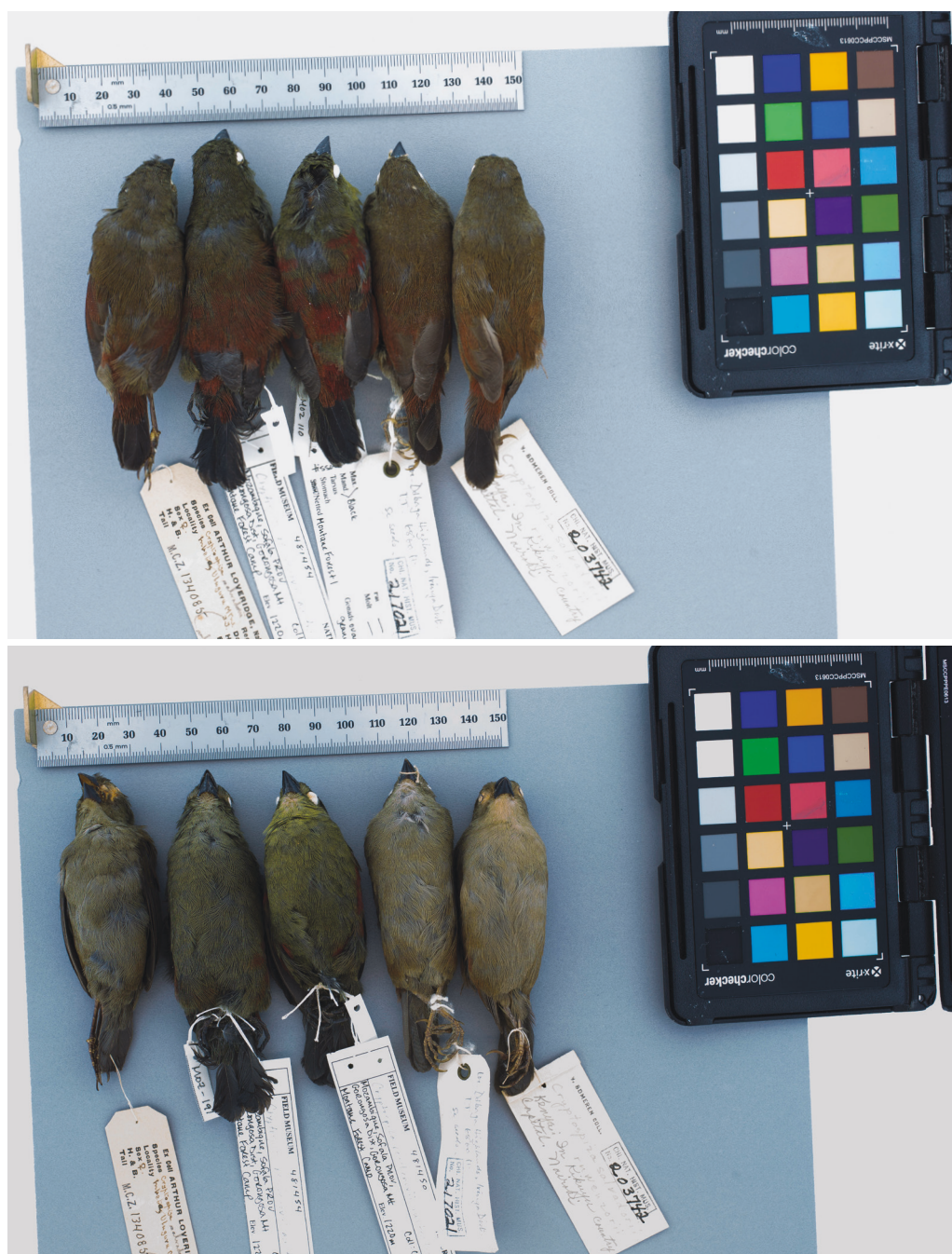
Figure 4. Comparative dorsal (top) and ventral (bottom) views of juvenile / immature specimens of Red-faced Crimsonwing Cryptospiza reichenovii australis and Abyssinian Crimsonwing C. salvadorii of both sexes, including the Loveridge specimen from the Uluguru Mountains described in Friedmann & Loveridge (1937). Specimens (left to right) as follows: C. r. australis (female, 'Mbeta' = Mgeta, Uluguru Mountains, Tanzania, leg. A. Loveridge, 24 July 1922, MCZ 134085); C. r. australis (male, Mt. Gorongosa, Mozambique, leg. S. Reddy, 20 August 2011, FMNH 481454); C. r. australis (female, Mt. Gorongosa, Mozambique, leg. C. Salema, 15 August 2011, FMNH 481450); C. r. australis (male, Dabaga Highlands, Iringa, Tanzania, leg. J. G. Williams, 26 March 1952, FMNH 217021); C. salvadorii ruwenzori (female, Nairobi, Kikuyu, Kenya, leg. V. G. L. van Someren, 24 May 1918, FMNH 203742) (N. J. Cordeiro)