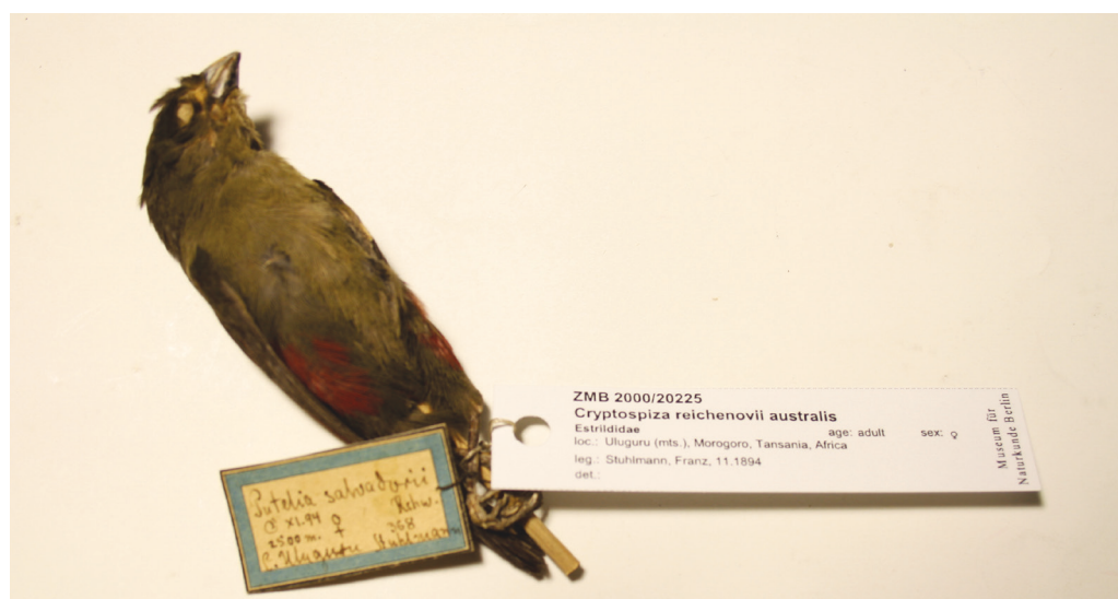
Figure 2. The female Cryptospiza specimen collected by F. Stuhlmann in October 1894 at 2,500 m in the Uluguru Mountains, Tanzania, initially identified as Abyssinian Crimsonwing C. salvadorii (presumably by A. Reichenow) and now correctly identified as Red-faced Crimsonwing C. reichenovii australis , Museum für Naturkunde, Berlin

Birds of Africa (Keith 2004) reported the ranges of wing and tail measurements, respectively, for females of C. salvadorii kilimensis (wing 56–58 mm, mean = 57.0 mm; tail 40–44 mm, mean = 41.9 mm) and C. r. reichenovii (wing 52–57 mm, mean = 53.9 mm; tail 36–41 mm, mean = 39.4 mm). As such data were not provided for C. r. australis , the race in the Eastern Arc Mountains to Malawi and Mozambique (Britton 1980, Keith 2004), we measured seven females of C. r. australis from Malawi, Mozambique and the Uluguru Mountains from the FMNH series. One Uluguru adult female (MCZ 134084) measured 54 and 39 mm for wing and tail, whereas the juvenile female (MCZ 134085) correspondingly measured 50 and 41 mm, respectively. Wing and tail measurements of C. r. australis were 52–56 (mean = 54.9) and 36–40 (mean = 39.2) mm, respectively. Comparing these measurements places the adult MCZ specimen within the range of C. reichenovii rather than C. salvadorii .