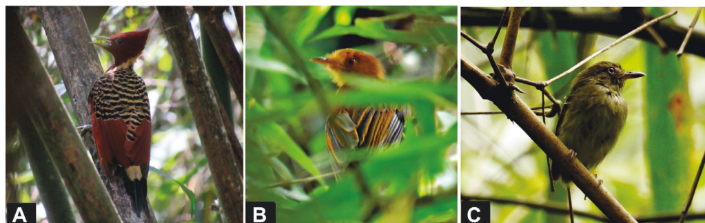
Figure 3. Three endemic species from the Inambari center associated with patches of Guadua bamboo recorded in the Humaitá Forest Reserve, Acre, Brazil. (A) Rufous-headed Woodpecker Celeus spectabilis. (B) Rufous Twistwing Cnipodectes superrufus. (C) Acre Tody-Tyrant Hemitriccus cohnhafti.