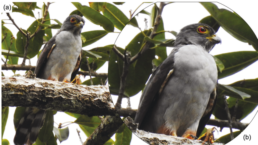
Figure 1. First documented record of Rufous-thighed Kite Harpagus diodon , dpto. Amazonas, Colombia, June 2019, showing (a) predation of a lizard, and (b) the two notches in the maxilla (William Daza-Díaz).

2,607 records were from the breeding season (Fig. 2a), 56 during northbound migration (Fig. 2b), 260 during the non-breeding season, including our own record (Fig. 2c), and 209 during southbound migration (Fig. 2d). Additionally, the first breeding / migration overlap category in March accounted for 90 records, and the second breeding / migration overlap category in October for 369 (Fig. 2).