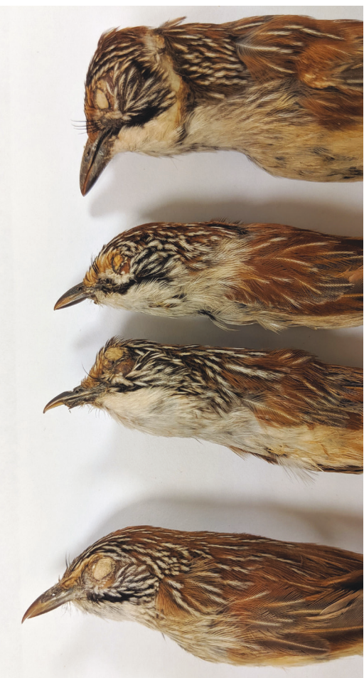
Figure 6. Bill profiles of the same specimens as in Fig. 5, from above in reverse order; A. w. whitei female AMNH 598127; A. whitei (Cape Range) female AMNH 598126; A. whitei (Cape Range) male AMNH 598125; A. w. oweni male AMNH 598115; note the small size and diminutive bills of the Cape Range specimens (B. Bird)

Type locality, distribution and habitat. —Carter observed grasswrens only twice, and ‘at the same locality – viz., a rocky kopje’ (Carter 1903: 37) ‘on the table-land lying behind the ranges [inland from] the Yardie [Creek]’ (Carter 1902: 84), i.e. towards the southern extremity of the range. He described the Cape Range plateau as ‘broken table-land, mostly very rugged, with much spinifex, [where] in one place a few cabbage-tree palms occur, which is somewhat remarkable’ (Carter 1903: 31). Those relict palms Livistona alfredii occur at just one locality on the Cape Range (c.22°23’S, 113°54’E), 280 km or more from the nearest populations in the Pilbara (Humphreys et al. 1990), and rocky outcrops, perhaps Carter’s ‘kopjes’, are prominent nearby (SRM pers. obs.). We infer that grasswrens are restricted to the limestone plateau of Cape Range and perhaps only to its undissected southern portion. They are isolated from the nominate subspecies by 160 km of lowlands without suitable habitat (R. E. Johnstone pers. comm.). Carter (1903:37) described the type locality as having ‘low scrub and patches of spinifex round [sic]’ with bare patches and emergents, such as ‘a [native] fig tree’ ( Ficus sp.). In contrast, G. Lodge (pers. comm. per R. E. Johnstone) observed a pair in spinifex on sand hills at the top of the range in the 1980s. The Cape Range is broadly