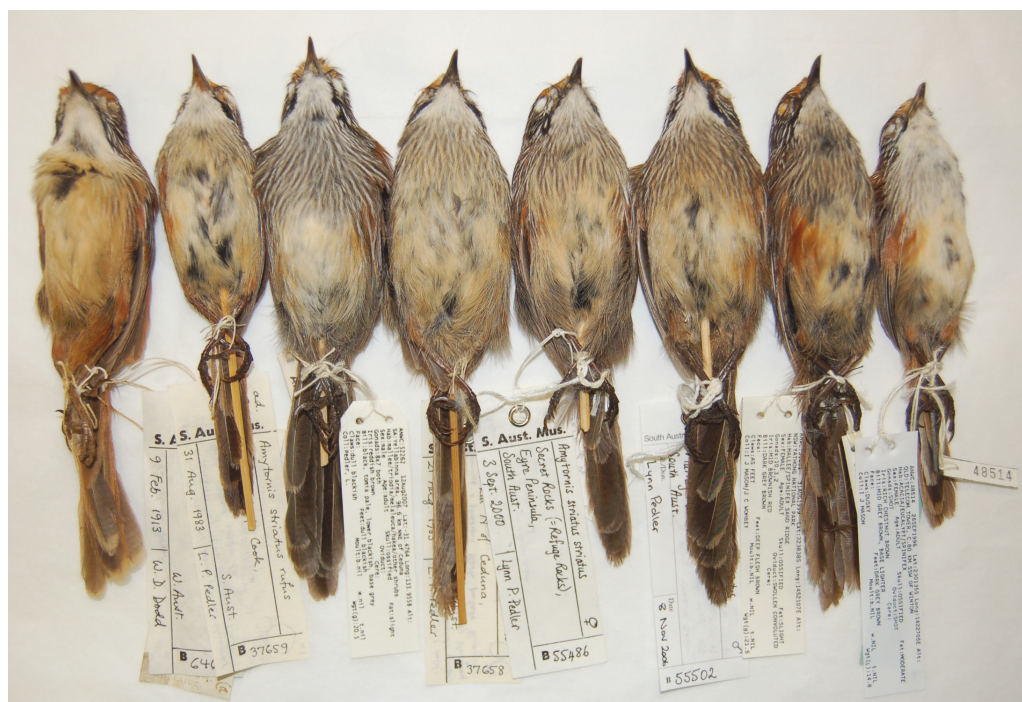
Figure 3. Ventral view of the same specimens in the same order, as in Fig. 2. Note the more evenly distributed cinnamon underparts of A. w. whitei (P. Horton)

cinnamon-rufous in A. w. oweni . Generally, Eyre Peninsula specimens are predominantly rufous-russet to rufous, although two western (Yellabinna) specimens more closely resembled A. w. oweni and A. w. whitei in tone, being rufous to cinnamon-rufous. White dorsal feather streaking is narrower in A. w. oweni and less distinctly edged paler brown in both A. w. oweni and A. w. whitei (Fig. 2). Underparts also vary in all populations, generally pale buff or off-white, darker towards the flanks. In A. w. whitei and some A. w. oweni the tone is more evenly distributed on the underparts and is closer to cinnamon (Fig. 3). Bare parts are dark in Eyre Peninsula specimens, generally paler in A. w. oweni and A. w. whitei .