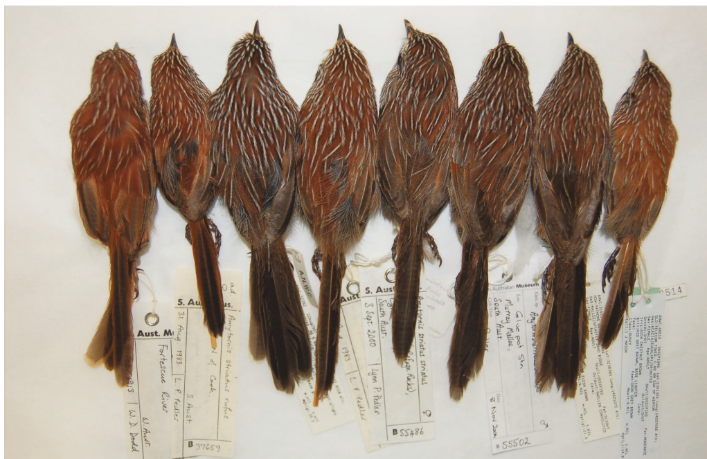
Figure 2. Dorsal view of specimens of the Striated Grasswren Amytornis striatus –Rufous Grasswren A. whitei complex; from left: A. w. whitei male, SAMA B646, Fortescue River, Western Australia, 9 February 1915; A. w. oweni female, SAMA B37659, 165 km north of Cook, South Australia, 31 August 1983; A. whitei (Yellabinnna) male, ANWC 52262, 96 km north of Ceduna, South Australia, 12 August 2007; A. whitei (Yellabinnna) male, SAMA B37658, 50 km north of Ceduna, South Australia, 21 August 1983; A. whitei (eastern Eyre Peninsula) female, SAMA B55486 Secret Rocks, South Australia, 3 September 2000; A. s. howei male, SAMA B55502, Gluepot Reserve, South Australia, 8 November 2006; A. s. striatus female, ANWC 31651, Yathong Nature Reserve, New South Wales, 31 August 1999; A. rowleyi female, ANWC 48514, 80 km south-southwest of Winton, Queensland, 26 September 1996; note the comparative size of A. w. whitei and A. w. oweni , and the variation in plumage tone between Yellabinnna specimens (P. Horton)

Plumage. —Dorsal tone varies individually within all populations of A. whitei but ranges from the darkest and duldest in Eyre Peninsula populations through brighter (more saturated) tones of A. w. oweni to the darkest rufous in A. w. whitei and palest