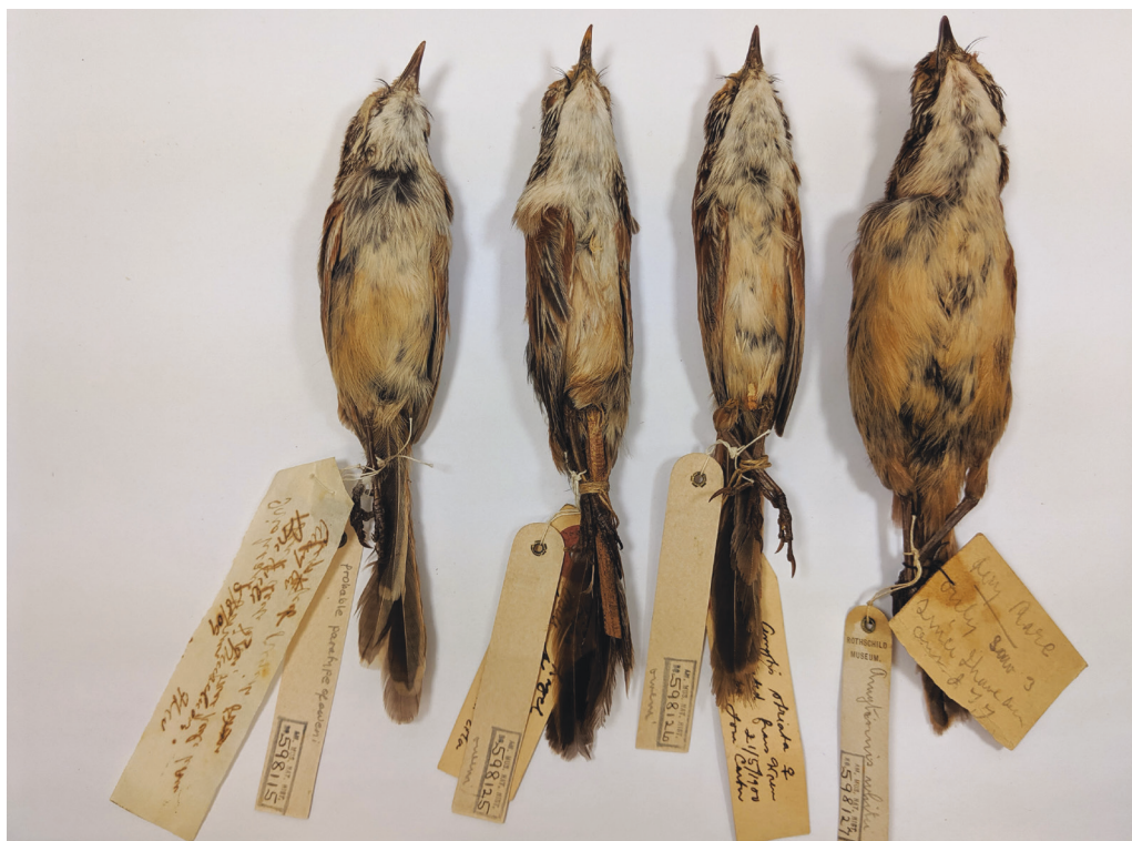
Figure 5. Ventral view of specimens of Rufous Grasswren A. whitei , from left: A. w. oweni male, AMNH 598115, Bore Well, Western Australia, 5 August 1909; A. whitei (Cape Range) male, AMNH 598125, 21 May 1900; A. whitei (Cape Range) female, AMNH 598126, 21 May 1900; A. w. whitei female, AMNH 598127, Marble Bar, Western Australia, 5 May 1901; note the small and barely streaked Cape Range specimens (B. Bird)

of the female. Measurements did not reveal a marked disparity in wing and tail lengths but confirmed Hartert's remark concerning the striking difference in bill size, 15.8 mm in Tunney's specimen, vs. 12.1 mm in the others (Fig. 6). The above Cape Range specimens are the only two adult skins known from this population and are here described as holotype and paratype of a new subspecies.