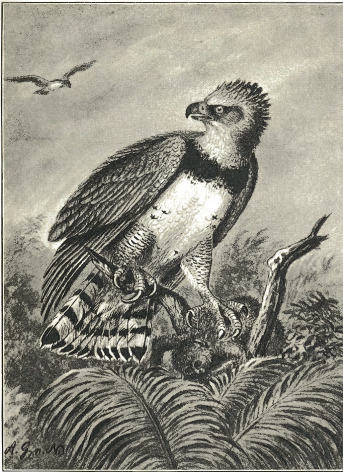
Figure 2. Lithograph of a Harpy Eagle Harpia harpyja from the lowland forest of the southern Lake Maracaibo basin, based on a painting by Anton Goering (Goering 1893).

Further documentary research has also yielded an impressive photograph of a group of Yukpa natives from the middle río Atapsi on the east slopes of the Sierra de Perijá (c.800–1,300 m, at the western border of the Lake Maracaibo basin) holding a dead Harpy Eagle (Fig. 4). It was taken by H. Ginés during an expedition of the Sociedad de Ciencias Naturales La Salle to these remote mountains, sometime during 1947–51 (Hoyos 1988). It is somewhat puzzling, however, that as Ginés was an ornithologist he did not mention the species in his comprehensive, annotated list of birds of the Perijá Mountains (Ginés et al. 1953).