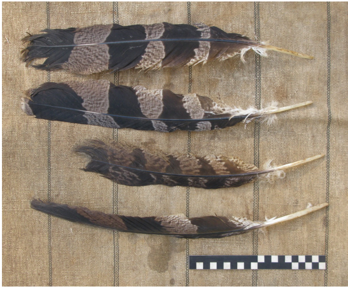
Figure 5. Top to bottom: two fresh rectrices of Harpy Eagle Harpia harpyja , a smaller worn tail feather or secondary of a Harpy or Crested Eagle Morphnus guianensis , and a Harpy Eagle primary (P. W. Trail in litt. to CJS, September 2016). These are from at least one or more large eagles taken by Barí people in the headwaters of the río del Norte, south of the village of Saimadoyi, in the Sierra de Perijá, Venezuela, August 1994.

Serranía de Abusanqui, a few km west of his house. Identification in this case was based on standard ethnozoological methods, in which the witness determined the species concerned using an illustrated field guide.