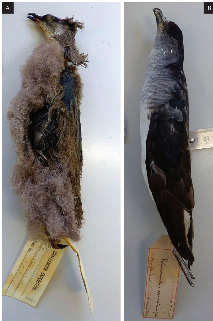
Figure 3. Lateral views of paralectotypes of Pelecanoides u. exsul. (A) South Georgia Diving Petrel P. georgicus juvenile, NHMUK 1880.11.18.661; (B) Pelecanoides u. urinatrix, NHMUK 1875.7.2.25

These designations fix the identity of P. u. exsul and maintain stability of the names most commonly used for Pelecanoides taxa globally. They therefore fulfil a primary objective of the International Commission on Zoological Nomenclature to promote stability of scientific names (ICZN 1999).