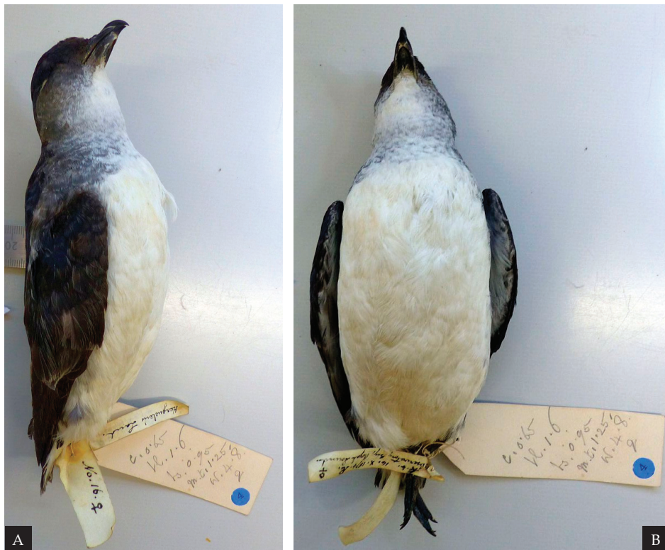
Figure 2. Lateral (A) and ventral (B) views of the lectotype of Pelecanoides u. exsul, NHMUK 1876.4.26.13