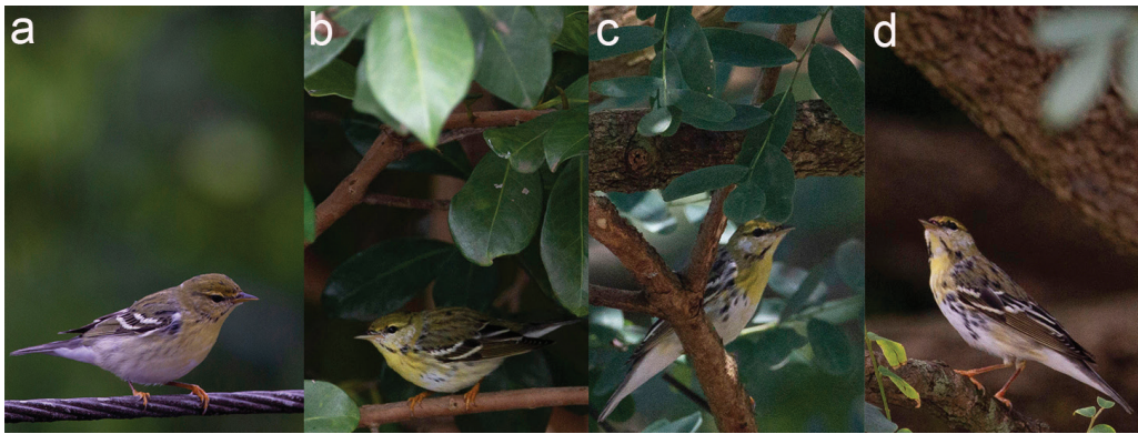
Figure 2. Plumage development of the Blackpoll Warbler Setophaga striata at Interlagos, São Paulo, Brazil: (a) 30 November 2020; (b) 27 December 2020; (c) 23 January 2021 and (d) 30 January 2021 (Fabio Schunck)