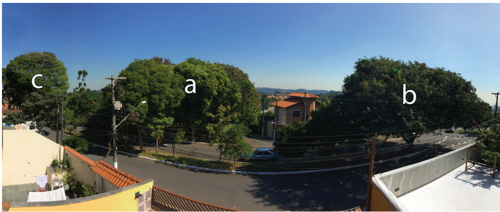
Figure 3. Vegetation at Interlagos, São Paulo, Brazil, in the three areas used by the individual Blackpoll Warbler Setophaga striata : (a) forested square, (b) Tipuana tree and (c) Caesalpinia tree

main sites (a–c) (Fig. 1, Interlagos inset). It spent most time in a large Tipuana tipu tree with a crown of c. 350 m 2 (area b; Fig. 3b). It usually moved between sites using intermediate trees, but occasionally made flights of c. 60 m from area b to area c, or vice versa.