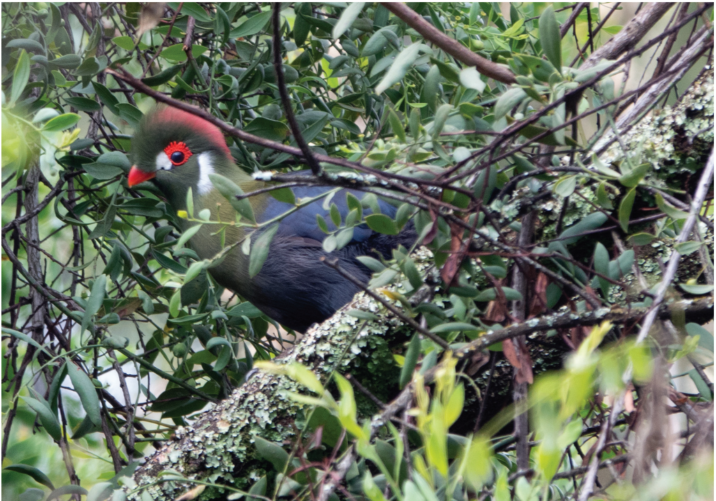
Figure 3. Crimson-crested Turaco Menelikornis (l.) donaldsoni , near Agarfa, May 2021; usually the crest coloration is less conspicuous when it is only slightly erected or not at all, as here