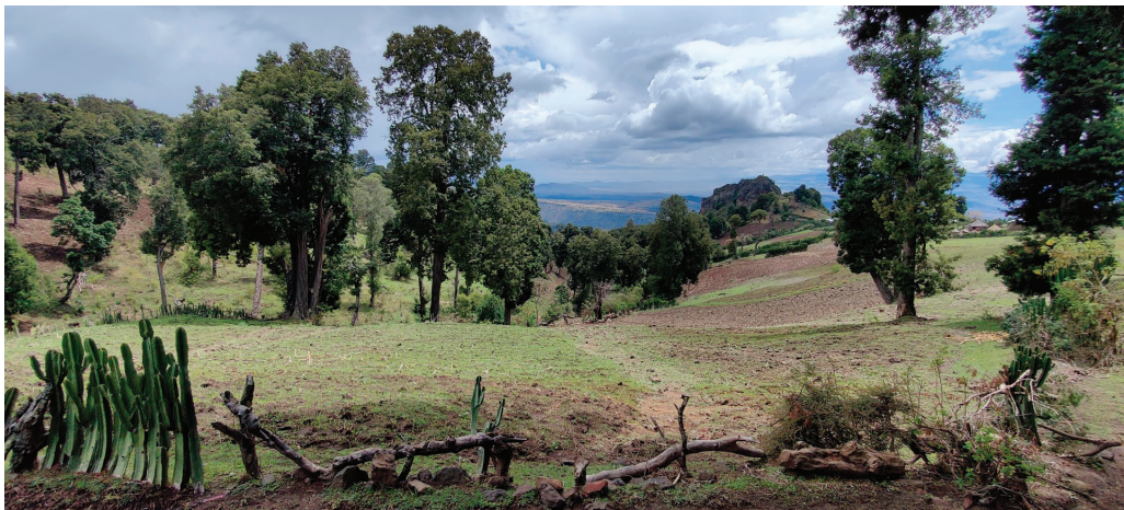
Figure 7a (above). Remnants of Podocarpus forest in the Oda Mts., which are heavily cultivated by smallholders. Crimson-crested Turaco Menelikornis (l.) donaldsoni survives here, despite the advanced state of habitat degradation. Figure 7b (below). Another former forest in an irreversibly devastated state, May 2021 (Kai Gedeon)

rifles'. In this context, a vernacular honorific appears inappropriate. Moreover, given the brilliant colour of the erect crest shown in Fig. 2, the name Maroon-crested Turaco used by del Hoyo & Collar (2014) seems less appropriate than Crimson-crested Turaco, which we here propose for donaldsoni .