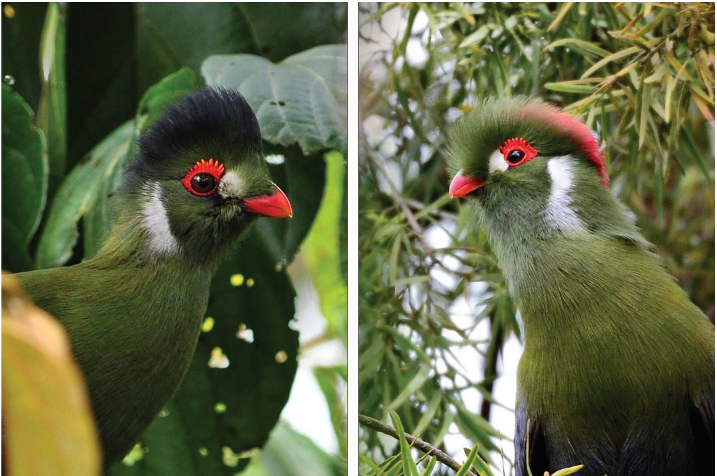
Figure 6. Left White-cheeked Turaco Menelikornis (l.) leucotis at Yergalem, south of Awasa, and right Crimson-crested Turaco M. (l.) donaldsoni at Goro Gutu, west of Harar; here only minor differences in the size of the cheek patches and peri-ocular wattles are apparent