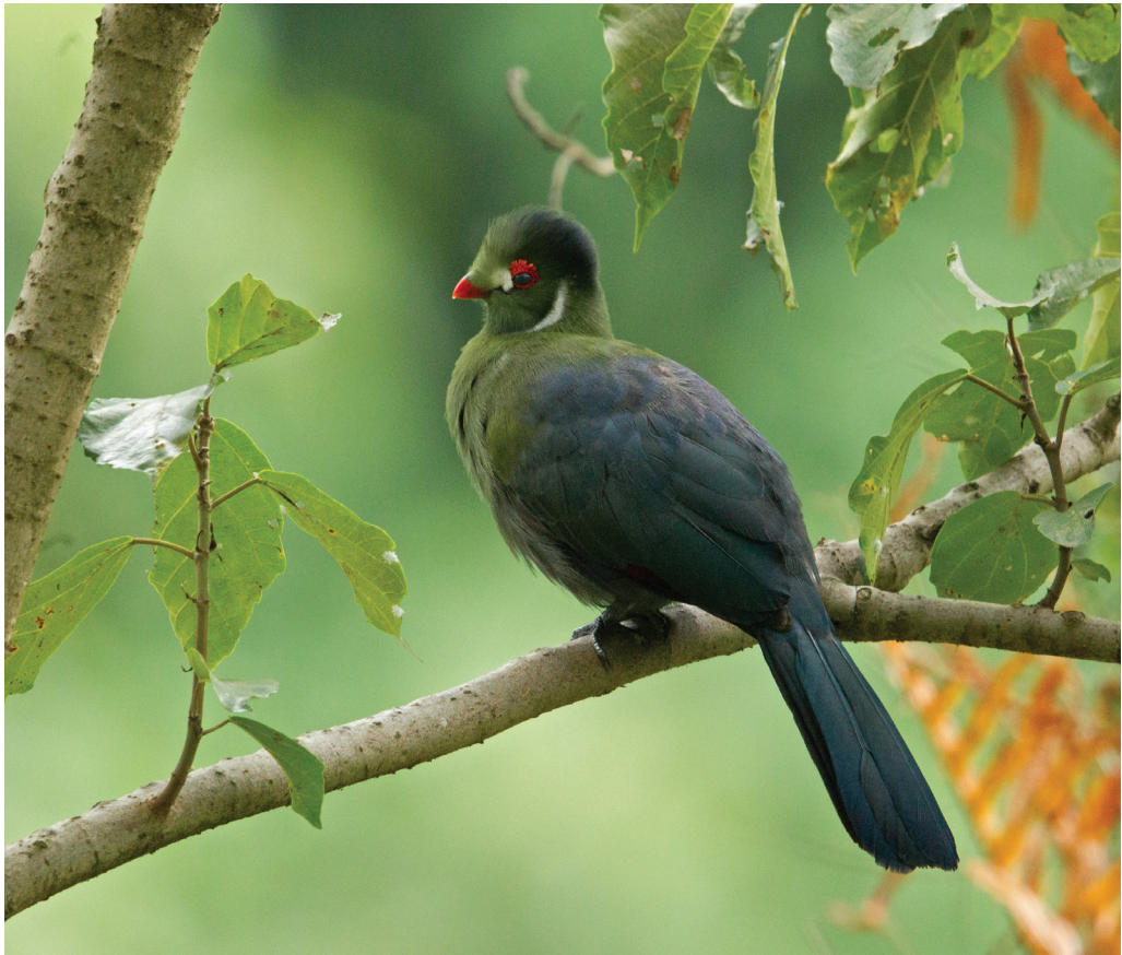
Figure 4. White-cheeked Turaco Menelikornis (l.) leucotis , Wondo Genet, east slope of the Rift Valley; note differences in size of white cheek patches and mantle colour compared to donaldsoni in Fig. 2

but there are no published studies of this in leucotis . Our own sound-recordings are unfortunately unsuitable for proper analysis. However, it may be worthwhile to explore possible differences in the vocal structure when high-quality recordings from the contact zone become available.