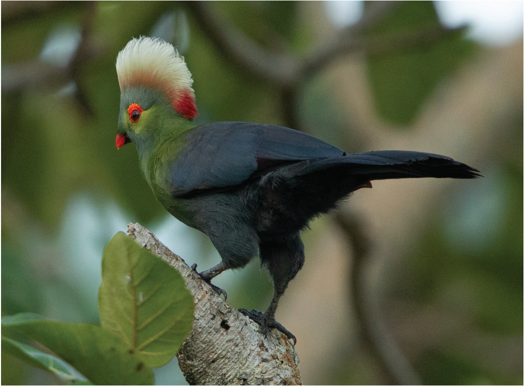
Figure 5. Ruspoli's Turaco Menelikornis ruspolii , near Negele, south-east Ethiopia