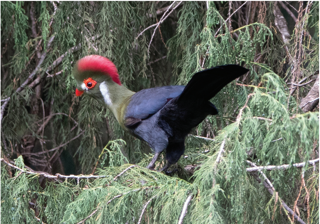
Figure 2. Crimson-crested Turaco Menelikornis (l.) donaldsoni , near Agarfa, June 2019; a bird obviously in a state of intense arousal with the bright crimson crest very striking