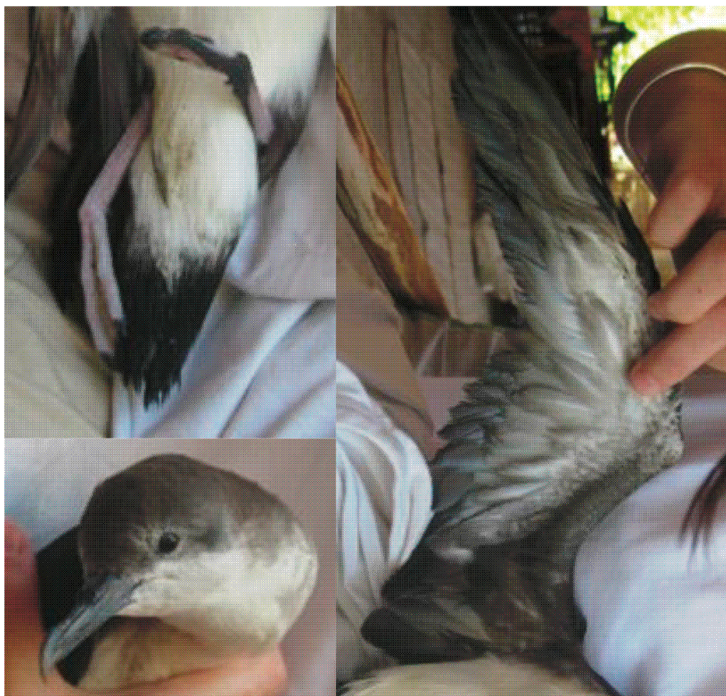
Figure 4. Persian Shearwater Puffinus persicus , ashore near Pangani, north-east Tanzania, 14 March 2009, showing the characteristic dusky underwing, axillaries, and faint white spot in front of the eye