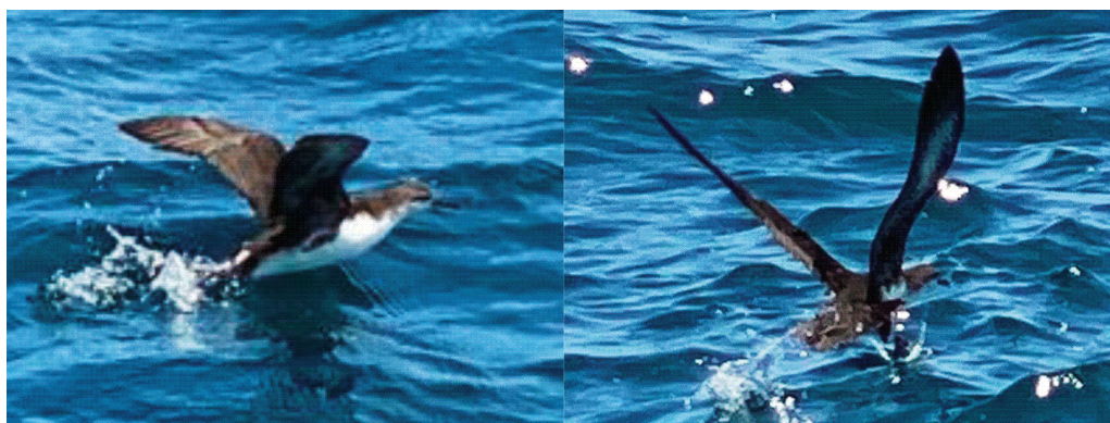
Figure 5. Persian Shearwater Puffinus persicus persicus , off Watamu, coastal Kenya, 1 March 2022, showing the characteristic brown-toned upperparts, much-reduced white in the underwing-coverts, dusky axillaries and brown flanks streaking of this taxon (Jaap Gijbbersen)