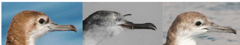
Figure 2. Persian Shearwater Puffinus persicus persicus off Oman (left ML 155569281;) and United Arab Emirates (right ML 93690941;) alongside the December 1981 specimen from Mtwapa Creek, Kenya (centre NMK B9189;), showing typical pattern of wear and fading on head producing white grizzling / streaking, and a poorly demarcated border between cheeks and throat.