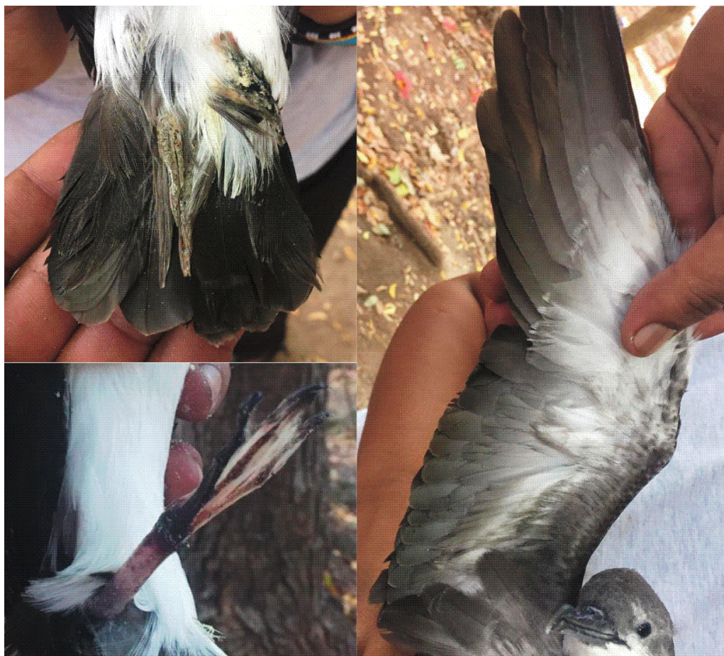
Figure 3. Persian Shearwater Puffinus persicus persicus , Diani, coastal Kenya, 26 February 2019, before it died

2. Puffinus persicus ; 14 March 2009 onshore at Emayani Beach Lodge, near Pangani, north-east Tanzania: plumage (flight feathers and tail) heavily worn but some body feathers (axillaries) fresh (Fig. 4). A beached bird 9 km south of Pangani, which was released alive, can be confidently referred to this species (Fig. 4) by the distinctive dusky underwings and axillaries, eliminating Tropical Shearwater. Additionally, dark undertail-coverts, an indistinct whitish spot in front of the eye, and rather brownish-black upperparts also support identification as Persian Shearwater. The absence of brown flank streaks or pale streaking behind the eye, albeit consistent with some nominate persicus , does not permit elimination of temptator , and therefore we leave this individual unassigned to subspecies.