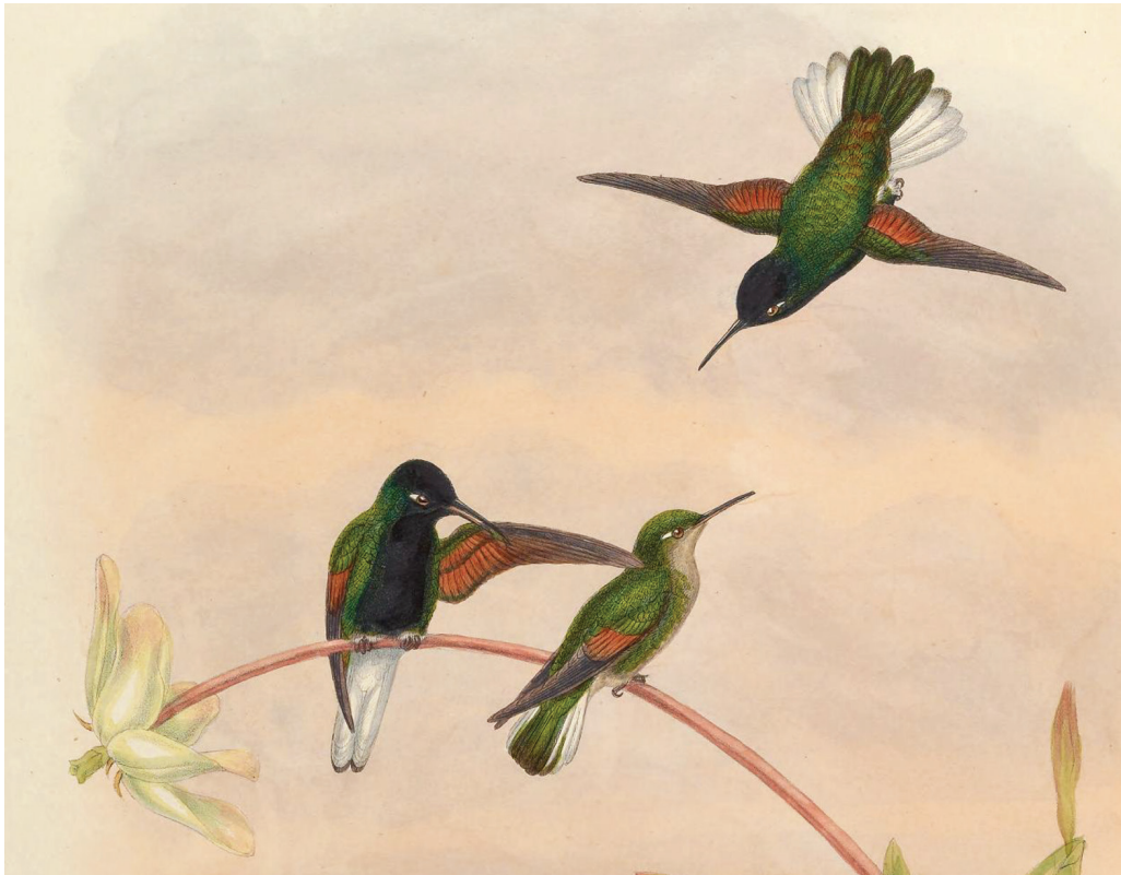
Figure 1. Plate 54 from the supplemental volume of A monograph of the Trochilidae, or family of humming-birds (Gould & Sharpe 1887), showing ‘ Callipharus nigriventris ’ (= Black-bellied Hummingbird Eupherusa nigriventris ). Note the bronzy-green colour and rounded shape of the tails ( contra Sangster et al. 2023). The annotations at the bottom of the plate read: ‘ Callipharus nigriventris / J. Gould & W. Hart del et lith. / Mintern Bros. imp.’

apparently overlooked that E. nigriventris has a ‘more strongly rounded’ tail than other Eupherusa species (Ridgway 1911: 399)—decidedly not square—as demonstrated by Gould & Sharpe’s (1887) original plate (Fig. 1), the lone E. nigriventris study skin in my sample (Fig. 2, DMNH 59857) and photos of live birds taken from an appropriate angle (e.g., Macaulay Library, ML 449382291). Furthermore, within the clade containing Eupherusa and its nearest relatives, the forked tail is not unique to [ T. ] ridgwayi —both Pirre Hummingbird Goldmania bella and G. violiceps have forked tails—and forked tails also occur in other clades of emeralds, as well as in more distant clades within Trochilidae. Therefore, this homoplastic character ought to ‘[carry] little weight in grouping taxa into genera’ (Sangster et al. 2023: 63).