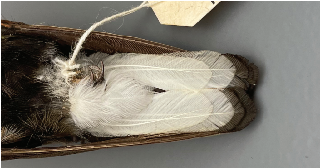
Figure 2. Ventral view of the closed tail of an adult male Black-bellied Hummingbird Eupherusa nigriventris (DMNH 59857), showing the rounded tail shape (i.e., outer rectrices are progressively shorter than inner rectrices)