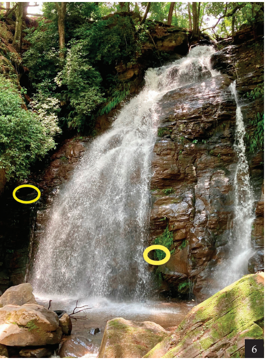
Figure 6. Salto de Agua, Yoricostio, Michoacán, Mexico, June 2022; left circle shows location of White-naped Swift Streptoprocne semicollaris nest, right circle shows location of White-fronted Swift Cypseloides storeri nest (Eric G. Horvath)

obscured many possible nest sites that I could not evaluate, but an evening watch might reveal swifts.