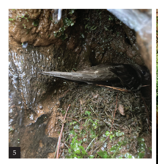
Figure 5. Adult White-fronted Swift Cypseloides storeri brooding small nestling in nest, Salto de Agua, Yoricostio, Michoacán, Mexico, June 2022 (Eric G. Horvath)

Figure 6. Salto de Agua, Yoricostio, Michoacán, Mexico, June 2022; left circle shows location of White-naped Swift Streptoprocne semicollaris nest, right circle shows location of White-fronted Swift Cypseloides storeri nest (Eric G. Horvath)