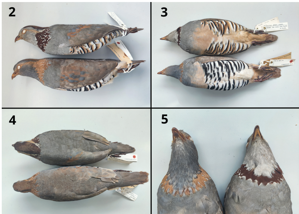
Figures 2–5. (Upper/right) male Barbary Partridge Alectoris barbara barbara , NHMUK 1965.M.1902, (lower/left) male Cyrenaica Partridge A. [b.] barbata NHMUK 1965.M.1904 (Alex J. Berryman, © Trustees of the Natural History Museum, London)