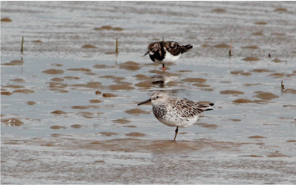
Figure 5. One of two Great Knots Calidris tenuirostris , Ponta da Barra, Mozambique, 6 March 2015