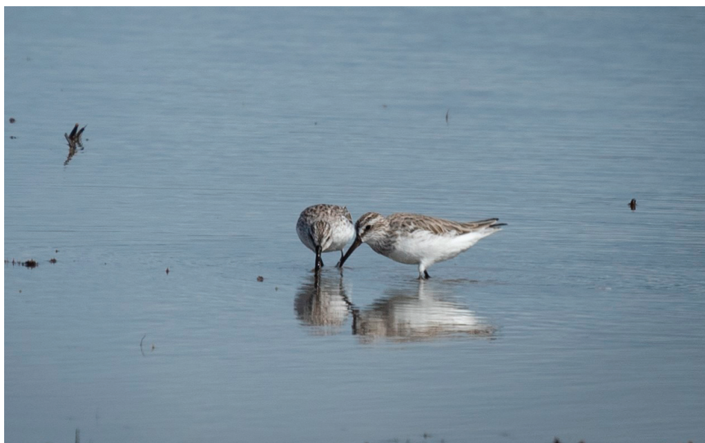
Figure 6. Broad-billed Sandpipers Calidris falcinellus , Lagoa Muangane, San Sebastian, Inhambane, Mozambique, 4 March 2022; the first documented country record

A vagrant in southern Africa with 34 records in September–February up to 1984, with most bird/months in January (Hockey et al. 1986). Records were on the west coast, notably Namibia and Langebaan Lagoon, and in the east, with a cluster of 16 records at Richards Bay, KwaZulu-Natal. The historical reports in Mozambique established the notion that Broad-billed Sandpiper occurs regularly in the country and the most recent specialist work