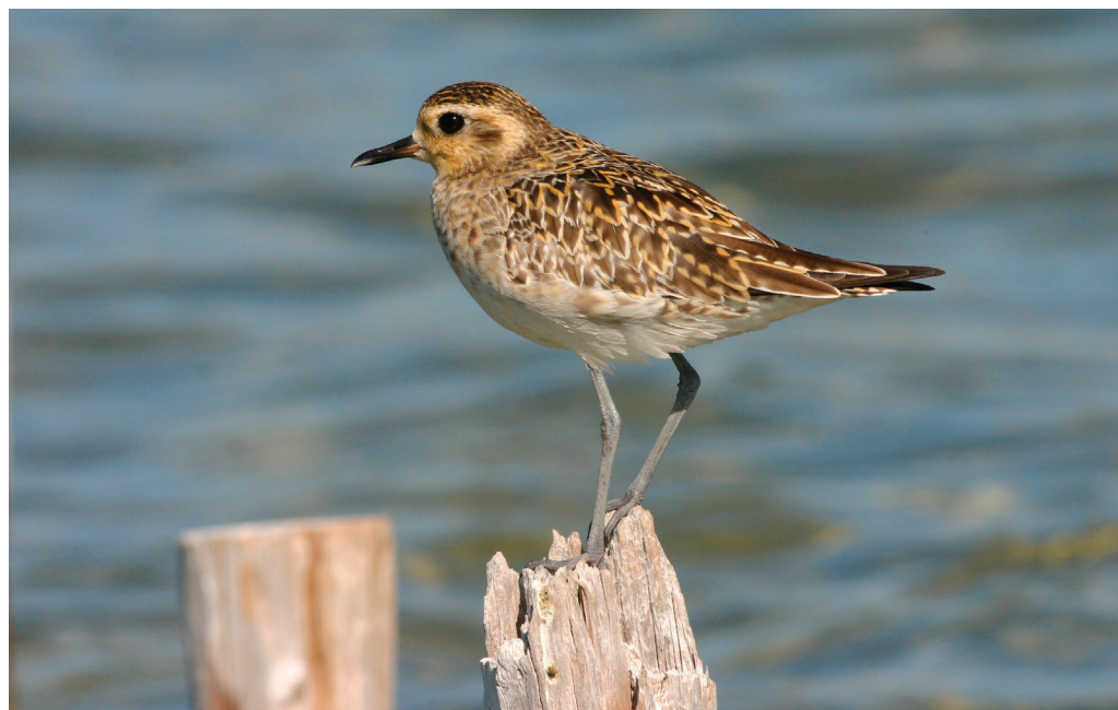
Figure 2. First-year Pacific Golden Plover Pluvialis fulva , Ponta da Barra, Inhambane, Mozambique, 21 October 2007; note short primary projection and longer tertials, which distinguish it from American Golden Plover P. dominica ; first documented record for Mozambique

No records mentioned for southern Mozambique by Parker (1999), however an observation at Ilha dos Portugueses off Ilha da Inhaca, in February 1987 was mentioned in Parker (2005) but no details were given by the observers (Nilsson & Shubin 1998).