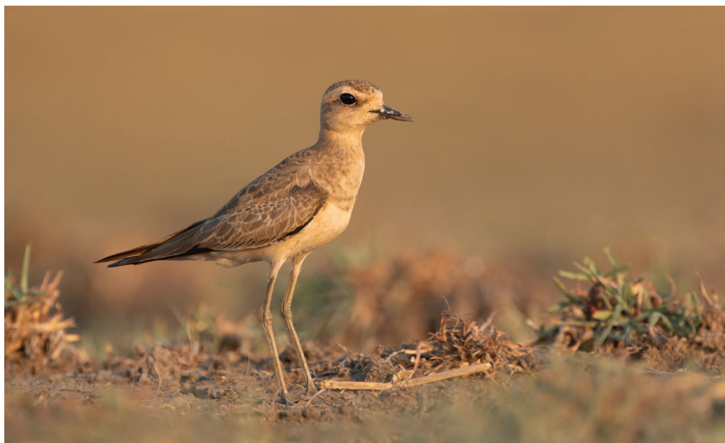
Figure 3. Caspian Plover Charadrius asiaticus , Gorongosa National Park, Mozambique, 23 October 2016; the first documented country record

2013; Brooks & Ryan 2024). A flock of 36 at Gorongosa National Park on 17 October 2016 (Z. Pohlen & C. Gesmundo in litt. 2016; S33982187; Fig. 3) was the first record supported by a photograph and was followed by a series of observations, mostly of 1–2 birds, until 16 November 2016. Finally, one at Macaneta on 4–25 February 2024 (JH & S. Jones, S160628994, T. & A. M. Moore, S161197293, JH, S162839291).