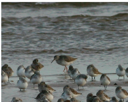
Figure 7. Common Redshank Tringa totanus , Ponta da Barra, Inhambane, Mozambique, 19 April 2008; the first documented country record

Subsequently, recorded as follows: singles at Ilha do Bazaruto on 4 November 1997 (K. Groenendijk, S1766796), Maputo on 12 March 2006 (R. Grey in Hockey et al. 2005 and Bull. Afr. Bird Cl. 14: 101), Barra on 19 April 2008 (M. Booysen in litt. 2021; the first to be documented, see Fig. 7), Panda/Chacane Wetlands on 5 November 2009 (M. Booysen in litt. 2021, T. Hardaker in Bull. Afr. Bird Cl. 17: 121) and San Sebastian