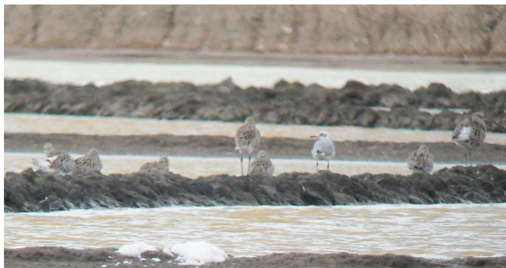
Figure 8. Seven Eurasian Curlews Numenius arquata , Salinas Zacharia, Mozambique, 12 January 2012, including at least two birds with strong supercilia and crown-stripes, and the bird on left also has white uppertail-coverts, features thought to be characteristic of N. a. suschkini (Gary Allport)

Birds from the eastern and western subspecies are visually distinct morphologically. Nominate arquata and suschkini are smaller than orientalis with less sexual dimorphism in size; arquata usually has barred axillaries and a dark-streaked lower rump and uppertail-coverts, whereas suschkini has white axillaries and a paler uppertail (Engelmoer & Roselaar