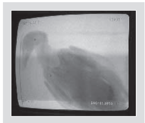
Figure 2. Standard airport security X-ray equipment was used to identify embedded shot. This common eider carries one pellet in the head and one in the breast muscle.

A total of 993 birds, i.e. 879 common and 114 king eiders, were examined for embedded lead shot by either passing them (N = 764 birds) through an airport security check X-ray device (Schlumberger Controlix 2E) at Nuuk Airport with parallel colour and B/W monitors connected, or by taking high resolution X-ray photographs (35 × 40 cm) at the local hospital in Nuuk (N = 229). The first method was applied to most drowned birds, whereas the latter method was used to safely distinguish between embedded shot and the larger pellets used to collect some samples. To verify the ability of the airport X-ray equipment to detect pellets, a sample of 10 birds with lead shot was inspected using both methods. The number of pellets in each carrier was counted, and in case more than one size of lead pellets could be identified (disregarding the large pellets used in sampling some of the birds) the number of each pellet size was recorded. For the wounded birds, notes were taken on the approximate position of the pellet(s), i.e. in the body, head, wings, legs or rump (Fig. 2).