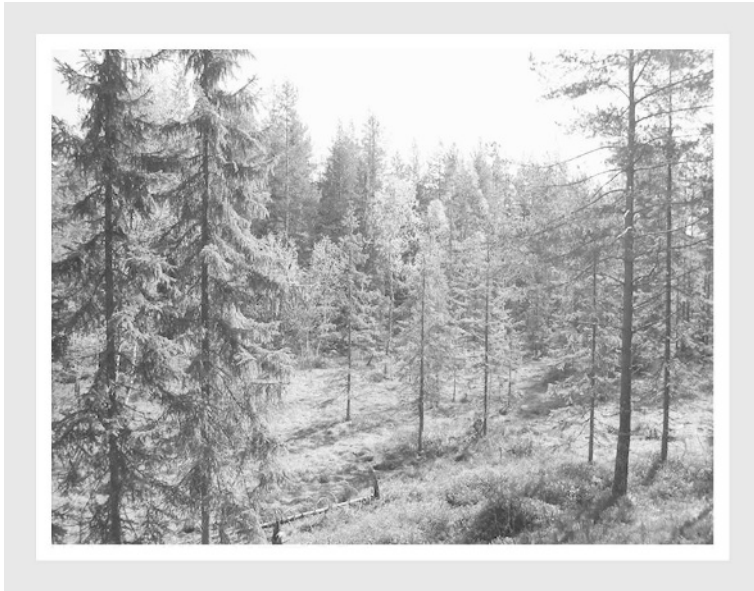
Figure 2. Central part of Lek 5, Anderstjern at Nordmarka, showing 42-year-old mixed pine and spruce forest in summer 2005 (see Table 1 for details on stand characteristics).

has been visited by > 5 females each year. We were not aware of females feeding in the area prior to lek initiation, thus, what attracted the males to the site in the first place is unknown.