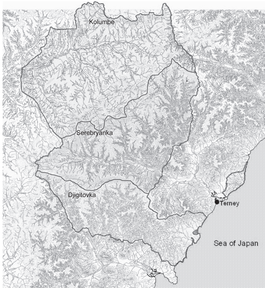
Figure 1. Map of Sikhote-Alin Zapovednik with Djigitovka, Serebryanka, and Kolumbe river basins delineated.

m perpendicular to the tiger's assumed pathway at a height of 0.5 m (Karanth et al. 2002). We deployed CamTrakker (CamTrak South Inc.) and Deercam (Non Typical Inc.) passive infrared cameras and replaced film and batteries regularly. We programmed camera traps to operate 24 h a day. We identified individuals from stripe patterns on their flanks, including adult and subadult tigers. We included all tigers identified in abundance estimates with the exception of cubs.