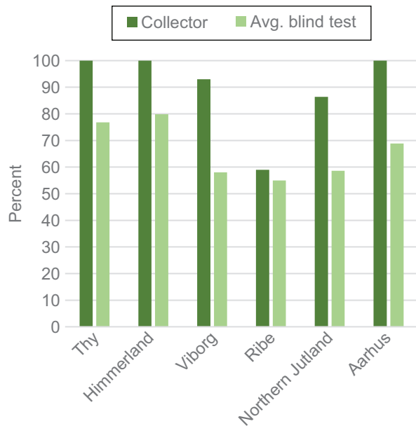
Figure 2. Results of the field identification of otter spraints conducted by the collectors (dark green) and the identification performed in the laboratory in the blind test (light green) according to the geographical sampling area.

(a potential proxy for population density) and experience of the personnel conducting the monitoring directly as in the present study.