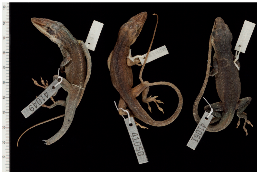
Fig. 1. Anolis carolinensis collected on 7 Mar 1950 in Kaimuki, Honolulu, Oahu, Hawaii (SDNHM 41049–41051), all males; Note the presence of dark postorbital spots, light flank spots (rather faint in SDNHM 41050) and a middorsal light stripe (only in SDNHM 41049). Scale in millimeters.