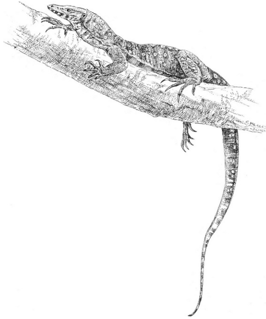
Figure 3. The water monitor, Varanus salvator . Illustration by Christopher Healey.

classification of large lizards and consider how these may illuminate local knowledge of V. komodoensis and the species' present or recent distribution.