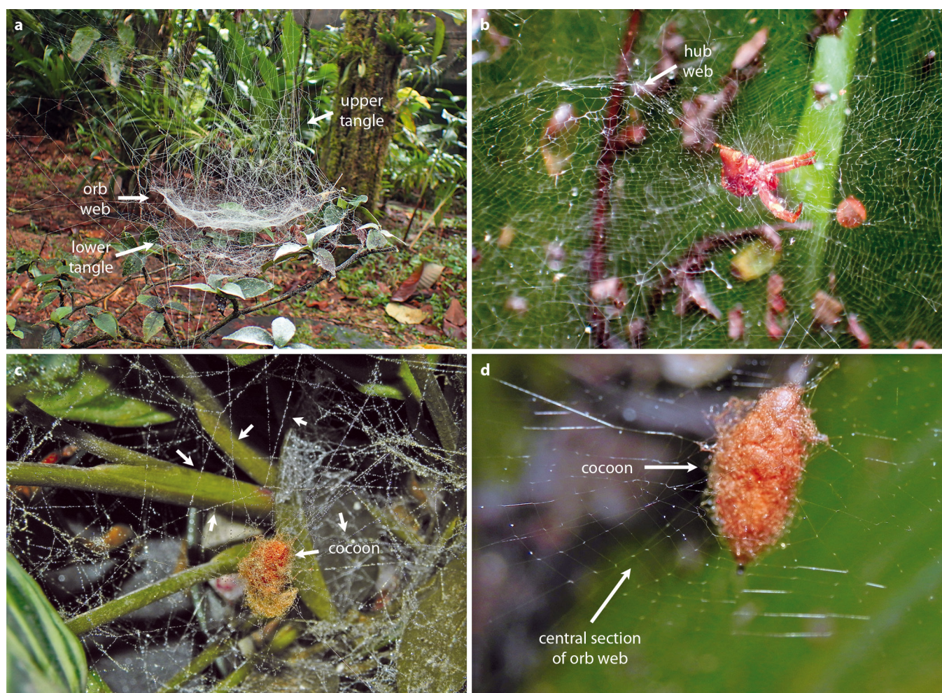
Fig. 1: Distinct aspects of the web of Kapogea cyrtophoroides . a. Natural web in the forest (the web in the picture is similar to at least other 20 webs we have seen in the field). b. The hub of a natural web. c. Cocoon web that the larva induced the spider to build after the spider was removed from its web; arrows point to cocoon web threads. d. Central section of the cocoon web and the wasp's cocoon

to 26.0 °C and the mean annual precipitation from 3500 to 4500 mm at these sites (Martínez 2012, Tirimbina Biological Reserve 2010). Spiders and their hosts were collected in mature and old second growth lowland rainforests.