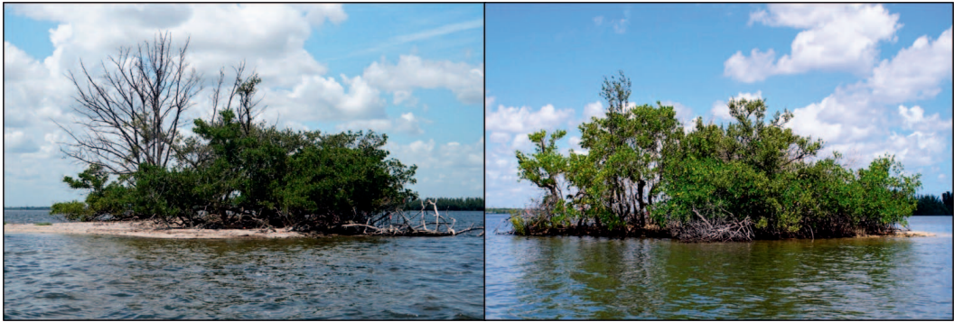
Figure 1. The two islands used for this experiment, SL1B (left) and SL13C (right). Photographed on 13 August 2018 by NCH.

establish sympatric populations on each island. These lizards came from larger, nearby islands where both species were relatively abundant (SL12: 27°29'55"N, 80°19'46"W; SL3: 27°32'07"N, 80°20'20"W; IR11: 27°48'01"N, 80°27'12"W), with each experimental island receiving a mix of individuals from each source island. Green anoles from our source populations have lived in sympatry with brown anoles for at least 25 generations (Campbell, 2000).