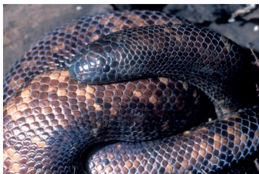
Figure 8. Calabaria reinhardtii , locality unknown (captive specimen).

Taxonomy. Described by Schlegel (1848) as Eryx reinhardtii , the type of the genus was given as Calabaria fusca Gray 1858. The genus was referred to as both Rhoptrura and Eryx in the 19th century until Boulenger (1893) stabilized the monotypic genus as C. reinhardtii . Kluge (1993) placed