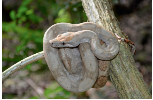
Figure 3. Boa imperator from Cayos Cochinos, Honduras.

Conservation Status. This taxon has not received an IUCN Red List assessment; it is, however, listed under CITES Appendix I