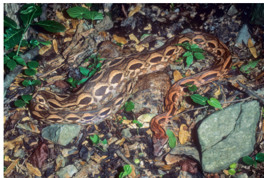
Figure 15. Acrantophis madagascariensis from Nosy Hara, Madagascar.

Acrantophis are not well characterized (Orozco-Terwengel et al., 2008).