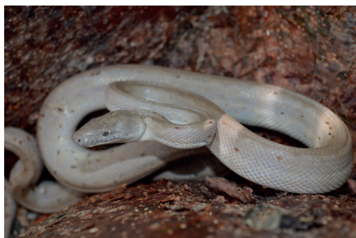
Figure 4. Chilabothrus argentum from Conception Island, Bahamas.