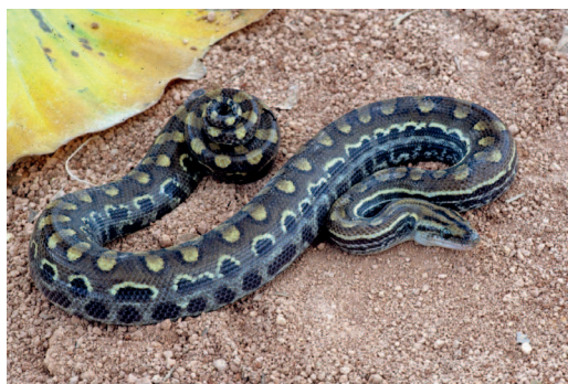
Figure 6. Epicrates crassus from Reserva Ecológica do IBGE, Brasília, Distrito Federal, Brazil.

Type Specimen. An adult, USNM 12413, from Gardosa, Río Paraná, Paraguay.