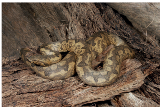
Figure 9. Candoia paulsoni mcdowellii from Milne Bay Province, Papua New Guinea.

Conservation Status. This subspecies has not been assessed, though it is likely persecuted (O'Shea, 1996).