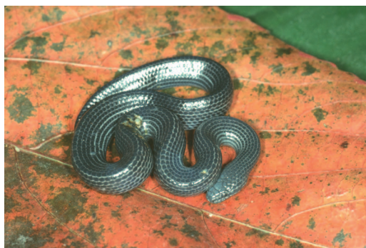
Figure 12. Exiliboa placata from Oaxaca, Mexico.

Taxonomy. Described as the type species ( E. placata ) in a new genus ( Exiliboa ) by Bogert (1968b). No subspecies are recognized.