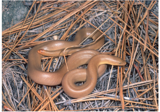
Figure 10. Charina bottae from Kern County, California.