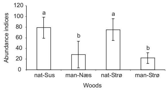
Fig. 1. Abundance index (all species/day) in the four forests. Identical letters indicate no significant difference between indices based on pairwise Turkey-Kramer Tests at p > 0.05 significance level. Sig-nificant differences at p < 0.001

It was assumed that the number of foraging observations serves as a good measurement of bird abundance in the forests (Table 1). Based on this assumption an abundance index was calculated as the average number of 1 st obs./day. The number of foraging observations was generally much higher in the natural old-growth forests than in the intensively managed ones. Daily mean number of observations in nat-woods were 76.9 ± 22.3 compared with 24.9 ± 16.3 in man-woods. The abundance indices in the forests for all species pooled was found to be significantly different (Repeated measures ANOVA based on