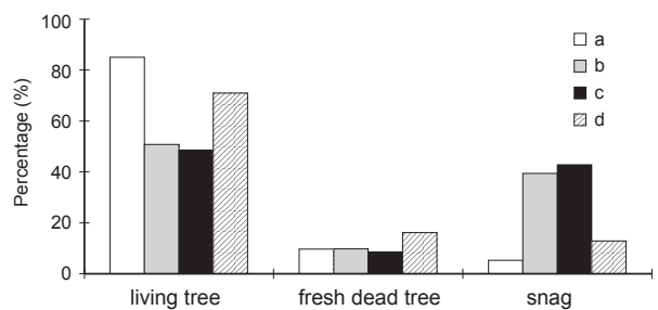
Fig 3. Tree condition of trees systematically sampled in plots (a, N = 863), trees with holes (b, N = 157), nest trees of excavators (c, N = 35) and nest trees of non-excavators (d, N = 62).

vators ( \chi^2 = 11.2 , df = 2 , p < 0.01 ). Given their relative abundance (Fig. 3), holes in snags were underused by non-excavators, while holes in living trees were overused by these birds ( \chi^2 = 14.5 , df = 2 , p < 0.001 ).