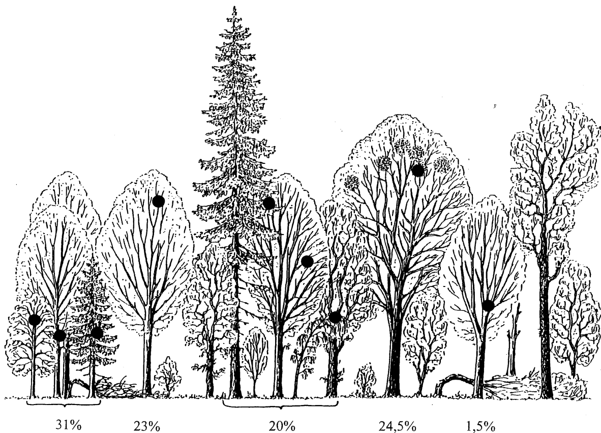
Fig. 3. Main types of the Hawfinch nest location in a high oak-lime-hornbeam forest of BNP. The illustration reprinted with the editors permission from Glutz von Blotzheim & Bauer (1997), but up-dated on larger material, N = 424 nests.

The Hawfinch nests in BNP are always placed in high and medium-size tree crowns. Of five types of nest location (Fig. 3), the four main are fairly similar structurally to each other. Most frequent (31%) are the nests at the main stem of a deciduous tree (often hidden in offshoots) or at a medium-size spruce crown. Three other locations are similarly frequent: in the mistletoe bunches, in uppermost vertical branches of old hornbeams and in branches of horizontally bent deciduous trees or on the lowest horizontal branches of huge spruces. Most exceptional (1.5%) are nests put Blackbird-like in a bifurcation of the bare main hornbeam stems, while the bush nests were not recorded at all. Disregarding described structural differences, the nests almost always were in sites with a free access from the air.