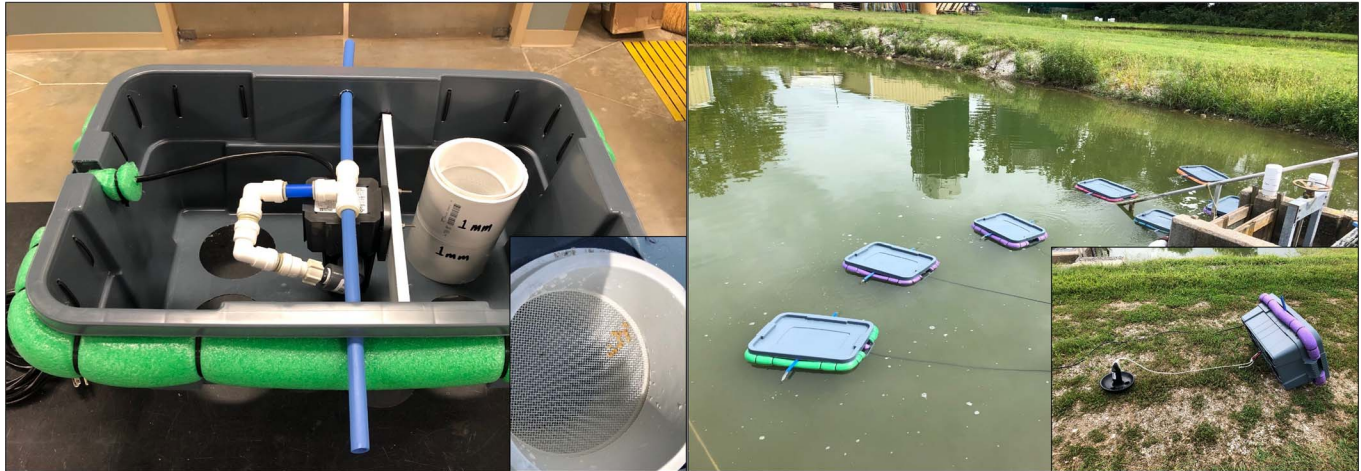
Figure 1. Floating upweller system (FLUPSY) used to hold juvenile mussels in the grow-out pond. (Left) Interior of FLUPSY with cover removed showing polyvinyl chloride holding chamber and water pump. (Right) FLUPSYS deployed in the grow-out pond. Inset shows anchor and line used to hold FLUPSYS in place.

cycle (Kunz et al. 2020). We conducted the bioassay at 23°C in a temperature-controlled water bath and ambient laboratory light (~500 lux) with 16:8-h light:dark photoperiod.