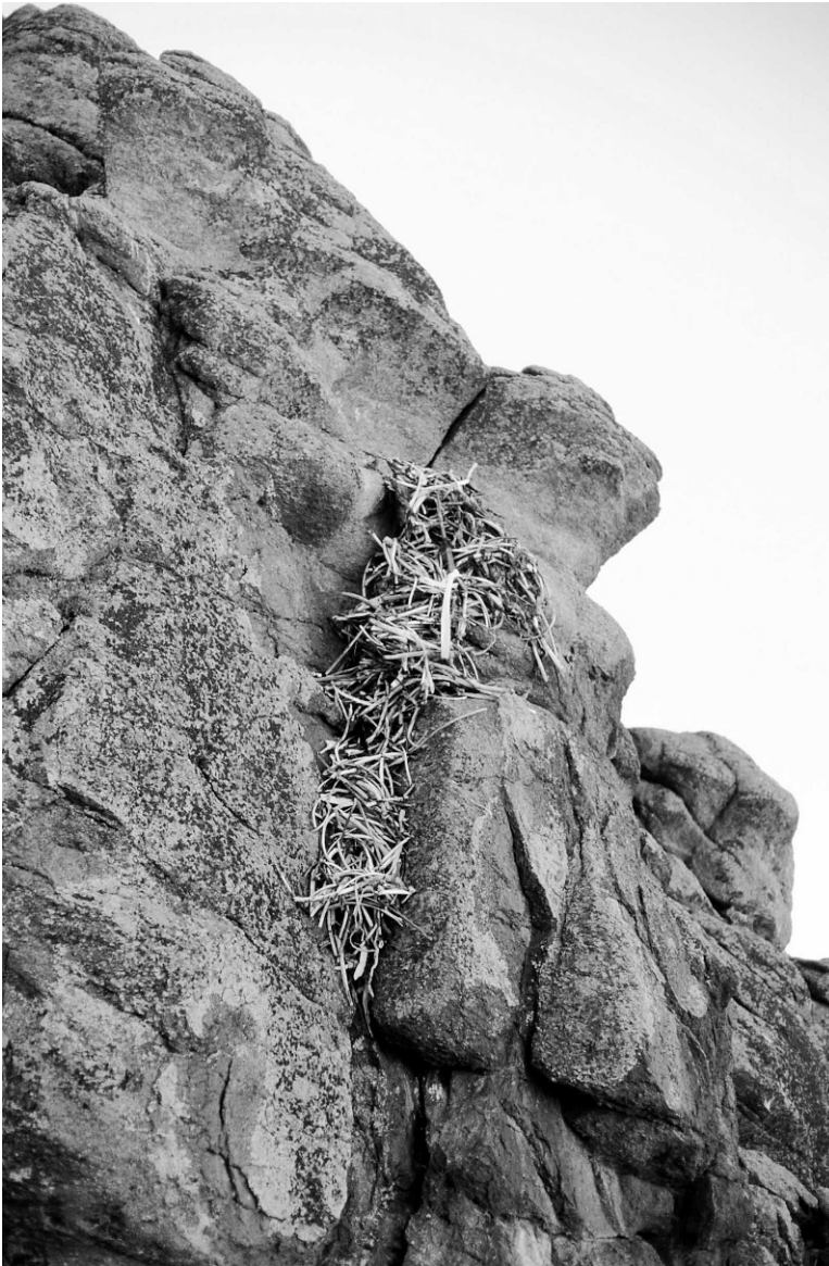
Figure 24. Common Raven nest (1998, central Mongolia) composed primarily of rib bones of large mammals. This nest was used in 2008 by Saker Falcons.

Geological Survey Southwest Biological Research Center, and Bureau of Land Management, Central Yukon Field Office.