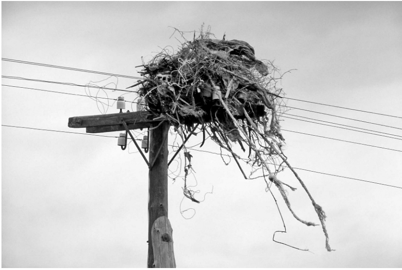
Figure 9. An extreme example of an Upland Buzzard trash nest in southeastern Mongolia, 4–5 June 1995.

wet snow overnight with temperatures just below freezing. The following morning, the single egg lay on bare metal. After waiting until the female left the ledge, we spread sand on the ledge and placed the egg in a shallow depression. Following the blizzard, the male ceased his courtship and food deliveries. People then provided the female with ground squirrel ( Citellus sp.) carcasses, which she ate. She laid three more eggs, but they were soon scattered about the ledge and disappeared one by one. Only one egg remained when the female finally abandoned the ledge. On sunny days in mid-May, the pair resumed courtship, including copulations, but no replacement clutch was laid, and no breeding attempt was made there in subsequent years.