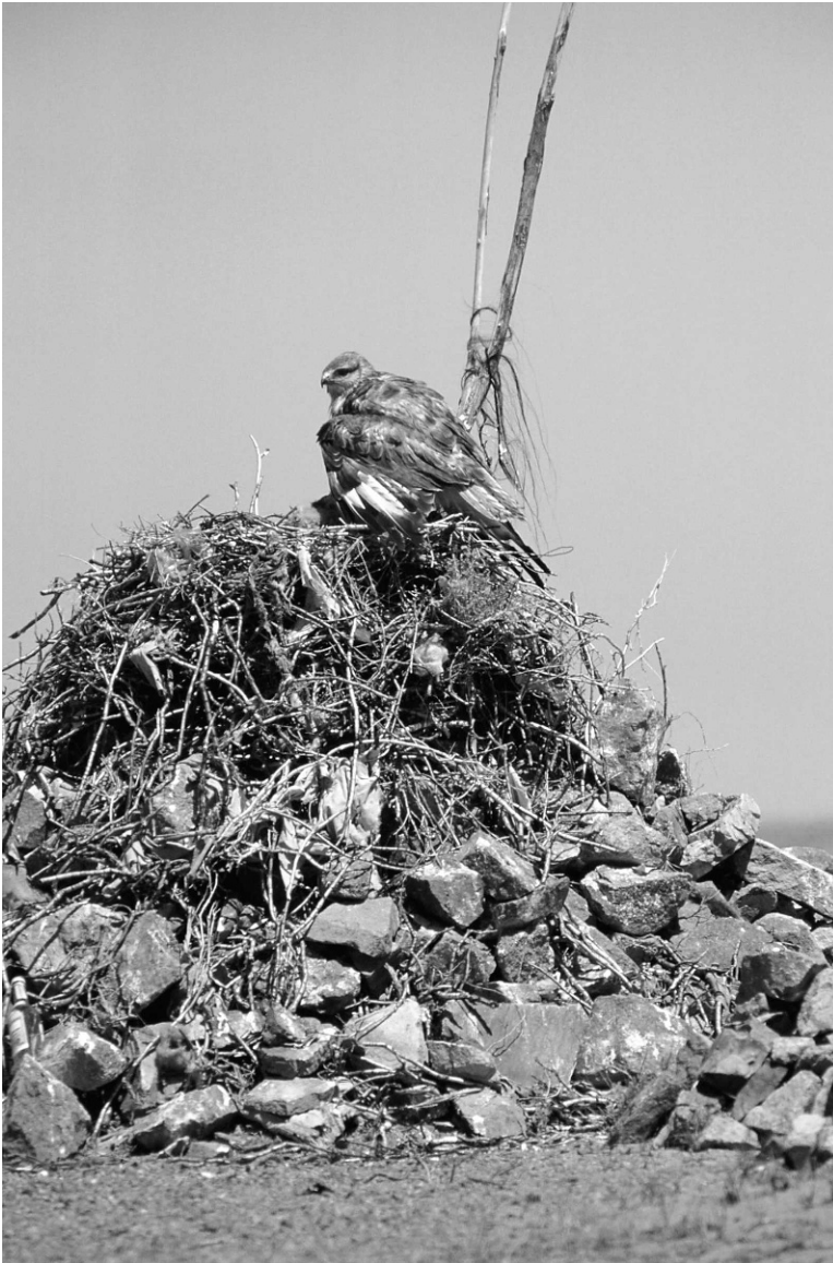
Figure 22. Upland Buzzard nest on a mountaintop shrine, southeastern Mongolia, 11 June 1997. Note that this nest, far from human activity, is built almost entirely of natural vegetation.

At two Golden Eagle nests in central and one in southeastern Mongolia, we noted that some sticks were larger than normally seen in eyries, so we measured the four largest. At one eyrie, the largest stick accessible (i.e., not buried in the matrix) was 2.31 m long (chord) and 2.76 m (along the curvature). Its circumference at base (hereafter “circ. b.”) was 11.6 cm (3.7 cm diameter). At another eyrie, the largest accessible stick was shorter (97.8 cm [chord];