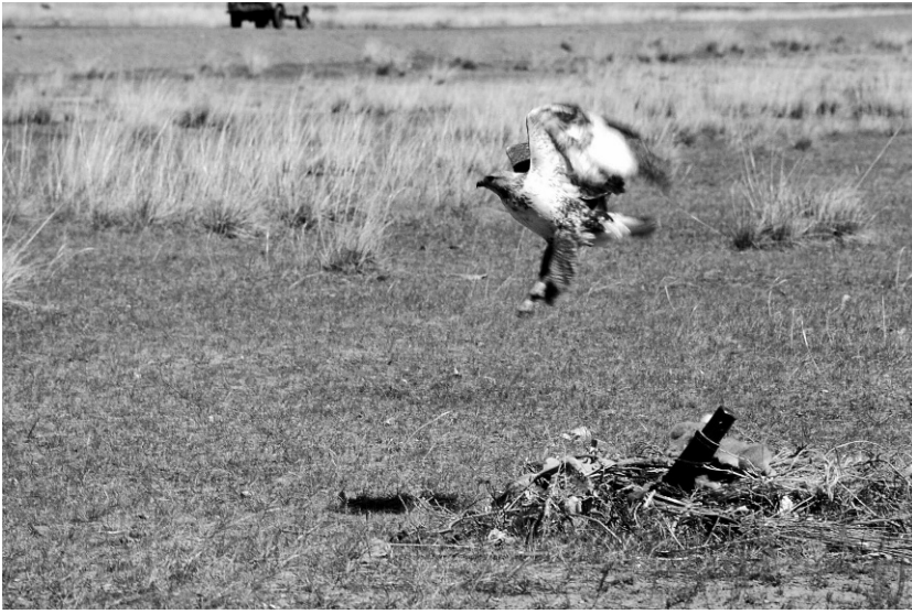
Figure 3. This Upland Buzzard nest (central Mongolia, 26 May 1995) is located at the base of a steel rod emerging from the ground.

nestlings follow the daily path of the pole's shadow. The need for shade also explains the placement of Lanner Falcon ( F. biarmicus ) eyries amid metal rubbish on the open Sahara Desert (Goodman and Haynes 1989).