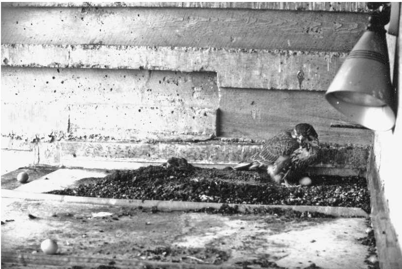
Figure 8. First documented nesting of Prairie Falcons on a building. Yearling Prairie Falcon at her scrape at the University of Calgary, 1 May 1974. Her third egg is in the scrape. The first and second are scattered about the metal ledge.

courting. The first egg was laid on 26 April in a thin layer of dried pigeon (Rock Pigeon [ Columba livia ]) manure on sheet metal in a back corner of a large, north-facing cavity (ca. 4 m \times 1.3 m \times 1.6 m high) just above the upper floor (Fig. 8). Rain turned to