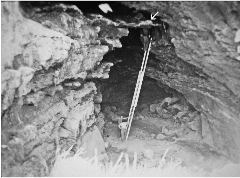
Figure 18. Prairie Falcon eyrie (arrow) recessed ca. 10 m from the opening of a lava tube on the Snake River Plain of Idaho. Pale streak is an adult falcon.

where foxes (two species) and wolves are widespread, most Golden Eagle nests are on cliffs, but we have found six nests on boulder-strewn hillsides, and two on flat ground at the very edge of a cliff, where a mammalian predator could easily walk to the nest.