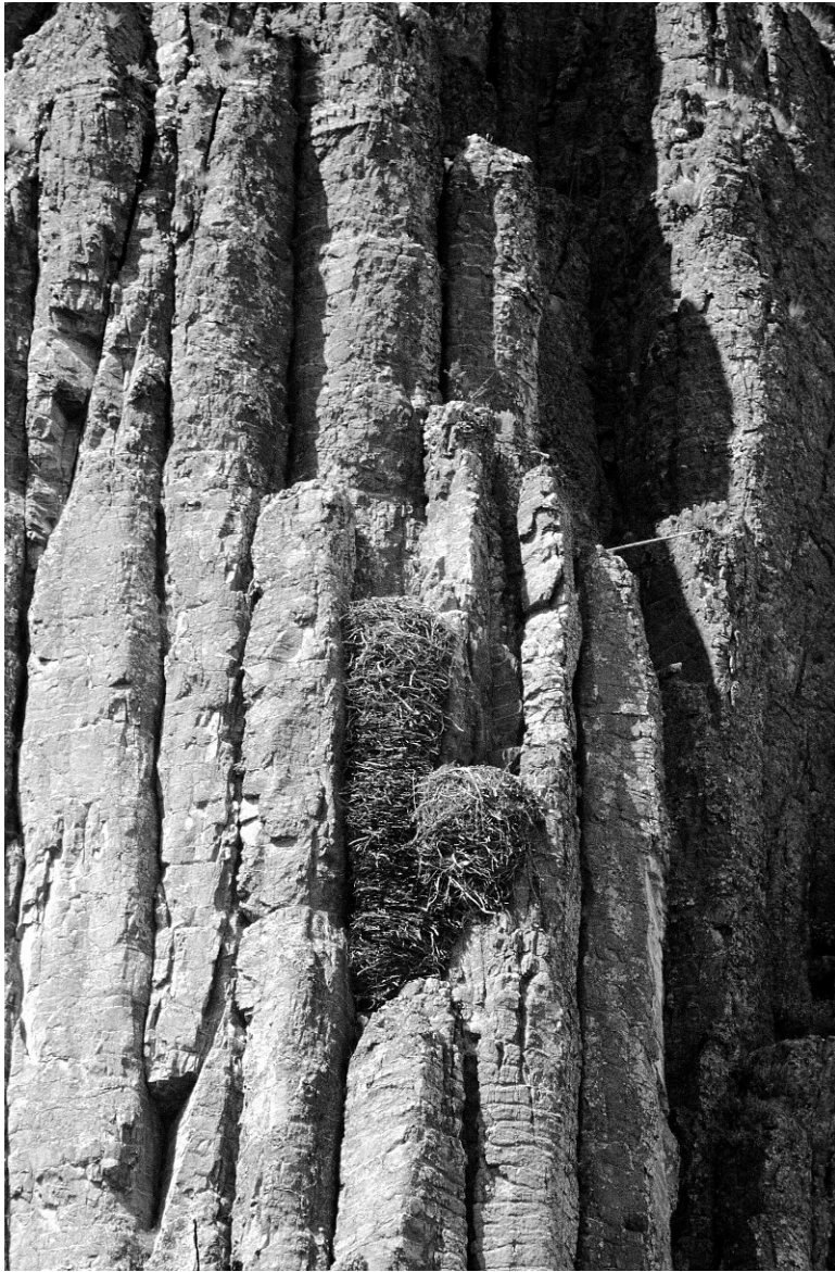
Figure 15. Sun River Golden Eagle nest in central Montana, 30 August 2002. In 2004, an extreme height measurement of the left, larger nest was 7.0 m.

to have been used in recent years, many molted Golden Eagle feathers were found at the cliff rim, and a lone adult was present on one of three visits.