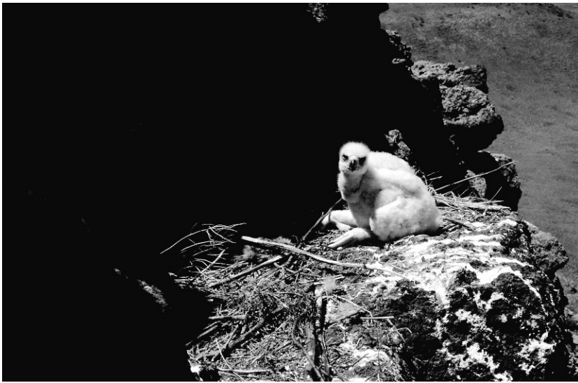
Figure 16. A rudimentary Golden Eagle nest in southeastern Mongolia photographed 11 June 1998. Eaglet rests on rock substrate.

the Colorado River. When inspected from the cliff rim, on 2 May 2000, a single young eaglet (age ca. 30 d) lay on a flat sandy shelf; no sticks other than the basal limbs of the shrub were visible. A sizeable stick nest was available at a distance of ca. 200 m.