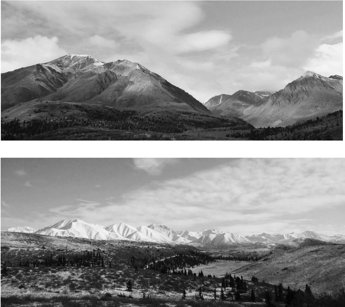
Figure 3. View looking to the northwest (top) and northeast (bottom) from an autumn observation site near Lost Creek on the southern slopes of the Mentasta Mountains, October 2014. In autumn, most Golden Eagles were detected as they migrated along the higher ridges of the Mentasta Mountains to the north of the observation site.

low along slopes or circling low over the landscape) and 91 appeared to be primarily intent on migrating. We did not observe any white feathering on most of the eagles we detected in spring 2014.