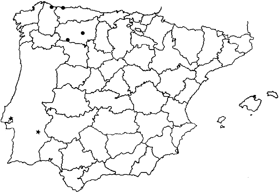
Fig. 2. Distribution of Bromus cabrerensis ● and B. nervosus ★.

800 \mu\text{m} thick, interrupted by a central cavity of 200–1700 \mu\text{m} in diameter. Epidermis with some prickles and macrohairs.