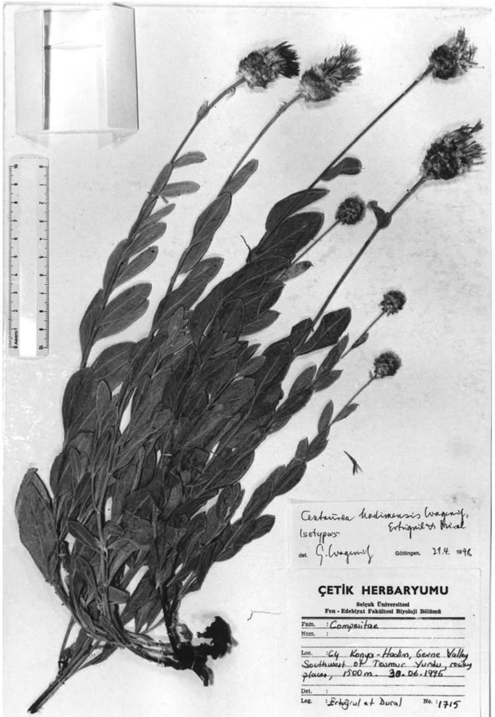
Fig. 1. Centaurea hadimensis (isotype at GOET).