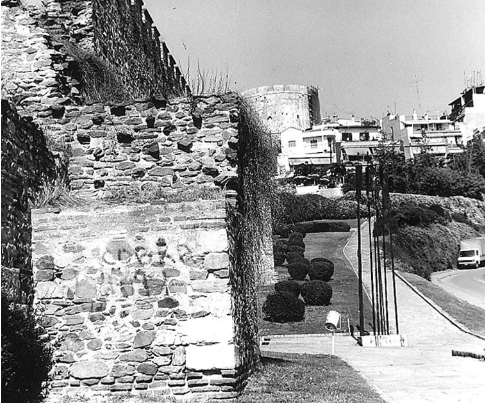
Fig. 2. The E part of the Byzantine Walls of Thessaloniki with Capparis spinosa subsp. spinosa growing on the side of the wall.

part. The greater intact part stands above Ag. Dimitriou Street. The height reaches up to 12 m, and the width ranges between 1.0 and 2.8 m. The style of the masonry varies according to the periods at which the different restorations were carried out. The greater part of the Walls, dating from the early Christian and the Byzantine periods, is constructed either of blocks of greenschist with interposed brick bands or of bricks decorated with rubble (Gounaris 1982). Mortar is mainly composed of lime and silicic materials in proportion of 1: 0.5-1: 2 (Papayanni pers. comm.). The Walls are surrounded by narrow open areas, up to 17 m from each side, which are either planted with a few species of ornamental trees and shrubs or are covered with spontaneous vegetation (Fig. 1-2).