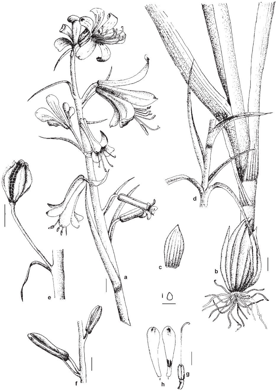
Fig. 1. Notholirion koeiei Rech.f. – a: inflorescence; b: habit; c: coat of the tunica; d: portion of the leafy stem; e: capsule; f: flower buds; g: pistil; h: tepal, dorsal (1) and ventral (2) side; i: seed. – Scale = 1 cm; drawing after plants of the population from near Aqrah.