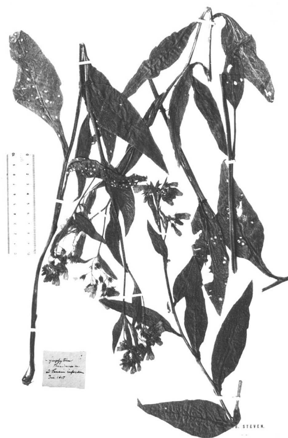
Fig. 4. Symphytum tanaicense – type specimen at the Botanical Museum, University of Helsinki (H).