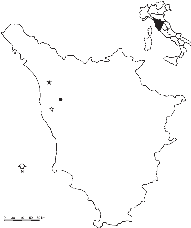
Fig. 3. Present stand of Symphytum tanaicense (black star), of S. officinale 2n=24 (black circle) and past stand of S. tanaicense (white star) in Tuscany, Italy.

(named Tanais in classical times) first collected and subsequently named S. tanaicense by Steven. We have no reasons to doubt Degen's (1930) conclusion that Kerner's S. uliginosum is synonymous with the latter as assumed in the following conclusions, but this question will be further dealt with after a careful analysis of Kerner's type specimen.